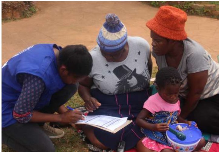
IOM DTM team undertakes the site assessments at Chimanimani Hotel collective centre

Round 3 data shows that 6,521 IDPs (824 households) were reported across the four districts, and of the total number only 865 individuals are Cyclone Idai affected IDPs. The largest number of IDPs displaced as a result of cyclone Idai are located in Makoni district (712 IDPs).