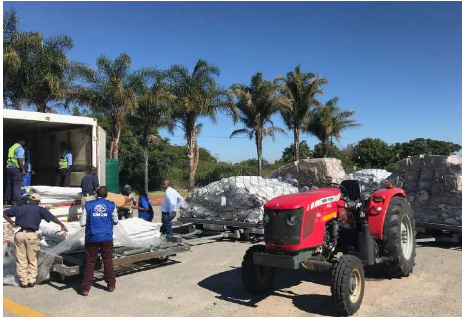
IOM receiving NFIs and tarpaulins for Cyclone Idai support