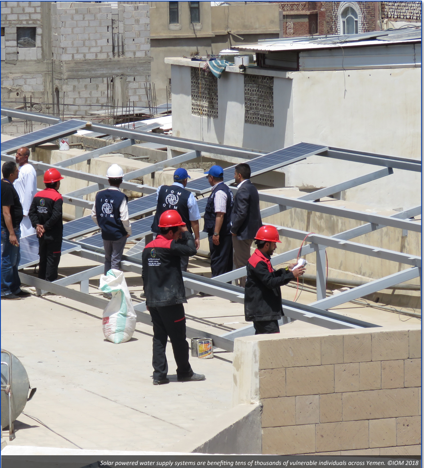
Solar powered water supply systems are benefiting tens of thousands of vulnerable individuals across Yemen.

IOM provides emergency WASH assistance to the most vulnerable, and restores and maintains water and sanitation systems towards the improvement of public health. This is achieved by provision of rehabilitation and maintenance of water supply systems, capacity building of WASH stakeholders, water trucking to IDPs, and hygiene promotion activities. During the reporting week, 344,000 liters of water was trucked to different water points, hospitals, and