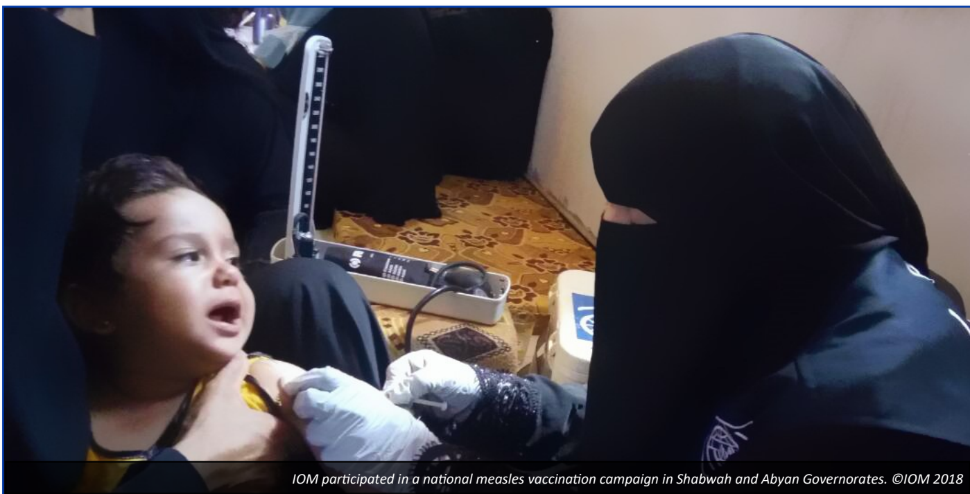
IOM participated in a national measles vaccination campaign in Shabwah and Abyan Governorates.

One cholera case was confirmed using a rapid test, among 160 suspected cholera/AWD cases (43 girls, 53 boys, 37 women, and 27 men) that were treated in Ibb through DTCs and ORPs as part of cholera response. IOM participated in a national measles vaccination campaign in Shabwah and Abyan Governorates during the reporting week and provided treatment and referral services for confirmed cases through its mobile health teams in the area. Focused psychosocial support services (PSS) was provided to 219 children and their parents—including 11 girls, 68 boys, 24 women, and 116 men)—through individual and group sessions conducted in Child Friendly Spaces (CFSs) in Sana'a and Aden. As part of supporting national programmes in the implementation of HIV/AIDS, TB, and Malaria activities in Yemen, 55,000 Long Lasting Insecticide Treated Nets (LLINs) were distributed among 21,600 host community and 2,138 IDP households in Taizz and Hodeidah Governorates. This is part of plans to distribute over 1.7 million LLINs in 2018, with over 800,539 LLINs already distributed to date. Additionally, IOM supported with conducting Malaria Assessment Survey among IDPs in Aden and Al Maharah Governorates, with similar assessments already conducted in Taizz, Hajjah, Al-Hudaydah, Marib, Amran, and Lahj Governorates.