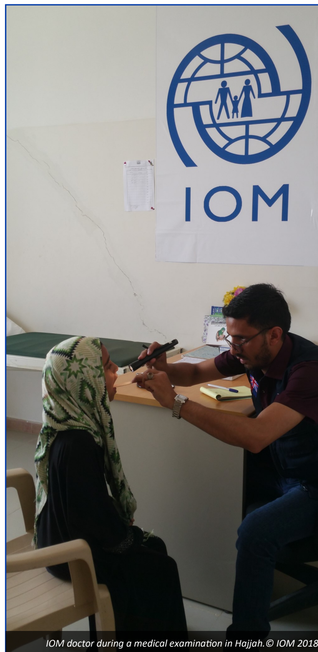
IOM doctor during a medical examination in Hajjah.

As part of this initiative, similar activities were carried out in places such as orphans schools, prisons, and camps and camp-like settings in Amran, Hajjah, Hudaydah, and Sana'a. 423 awareness sessions have been conducted, printed materials distributed among 36,735 people, 229 suspected cases referred for lab investigation, and 21 confirmed cases of HIV, Malaria or TB have been provided treatment since 2017.