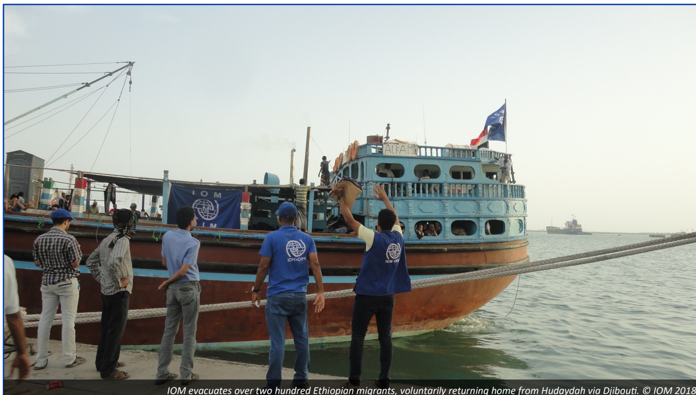
IOM evacuates over two hundred Ethiopian migrants, voluntarily returning home from Hudaydah via Djibouti.