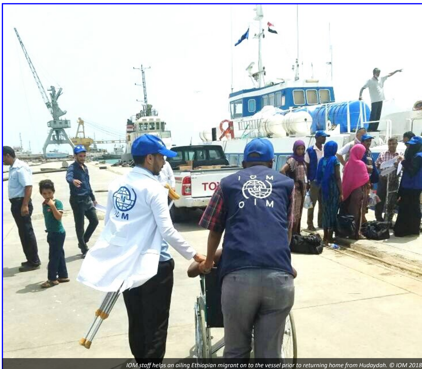
IOM staff helps an ailing Ethiopian migrant on to the vessel prior to returning home from Hudaydah.