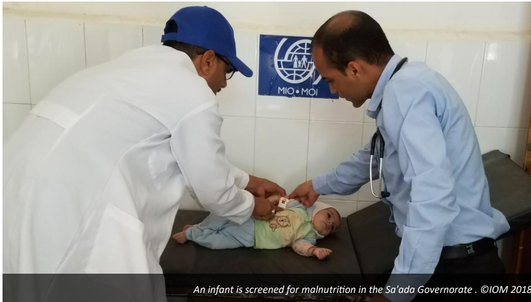
An infant is screened for malnutrition in the Sa'ada Governorate .

To support the surmounting needs within the health sector, IOM builds on its existing programming in Yemen and continues expanding access for girls, boys, women, and men to primary healthcare services, and provides medical and technical support to primary healthcare centres and hospitals. A total of 47 IOM-supported healthcare facilities are currently operational in Yemen , providing much needed care for Yemenis and migrants.