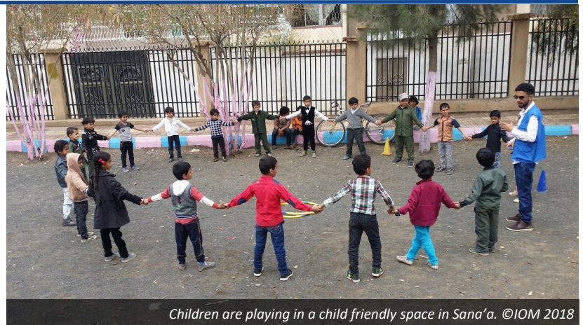
Children are playing in a child friendly space in Sana’a.

A total of 3,724 conflict-affected children (1,402 girls and 2,322 boys) benefitted from a range of activities—including acting, art, sports, and orientation on recycling and personal hygiene—provided in 34 Child-Friendly Spaces (CFSs) in Sana’a and Aden between 8 and 15 April 2018. In addition, 120 well-trained daily workers were assigned to CFSs with specific responsibilities pertaining to implementing CFS activities.