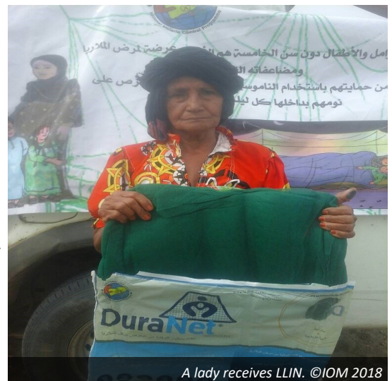
A lady receives LLIN.

IOM is managing the Global Fund (GF) Middle East Response (MER) Project in Yemen with an aim to support national programmes in the implementation of HIV/AIDS, TB, and Malaria activities in Yemen. In support of the National Malaria Control Programme (NMCP), a total of 306,250 Long Lasting Insecticide Treated Nets (LLINs) were distributed in the Hodeidah Governorate in the reporting week, with the 25 April–2 May LLINs Campaign aiming to distribute a total of 470,300 LLINs in high Malaria prone districts of Jabl rass, Algarahi, Bait alfakih, Altuhaita, Almansoria, Aldoraihmi, Almarawia, Bajil, and Alhajaila.