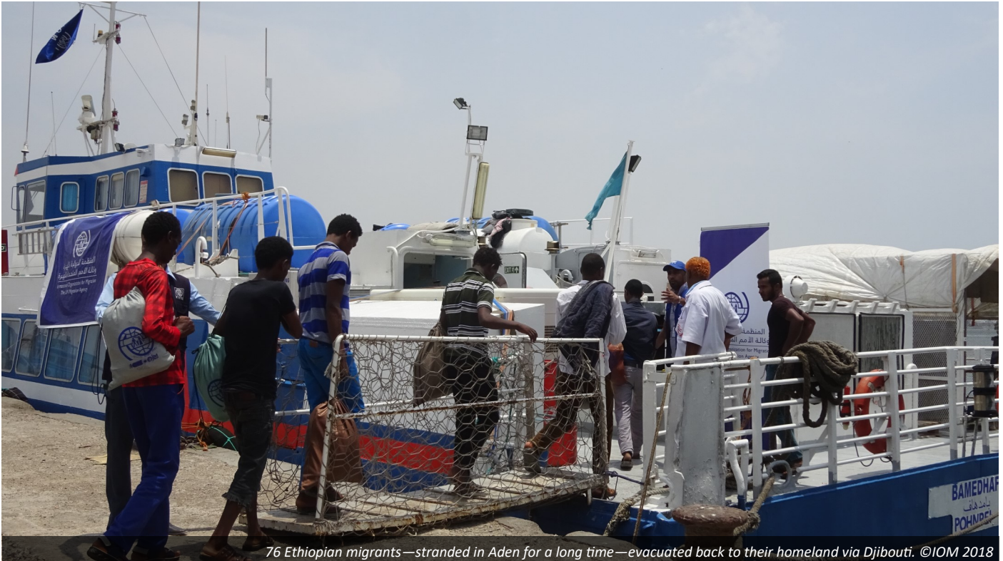
76 Ethiopian migrants—stranded in Aden for a long time—evacuated back to their homeland via Djibouti.