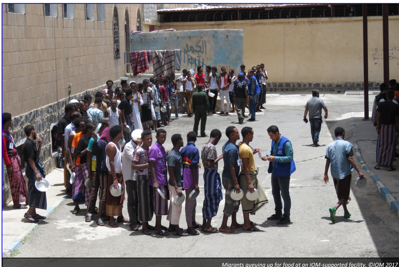
Migrants queuing up for food at an IOM-supported facility.