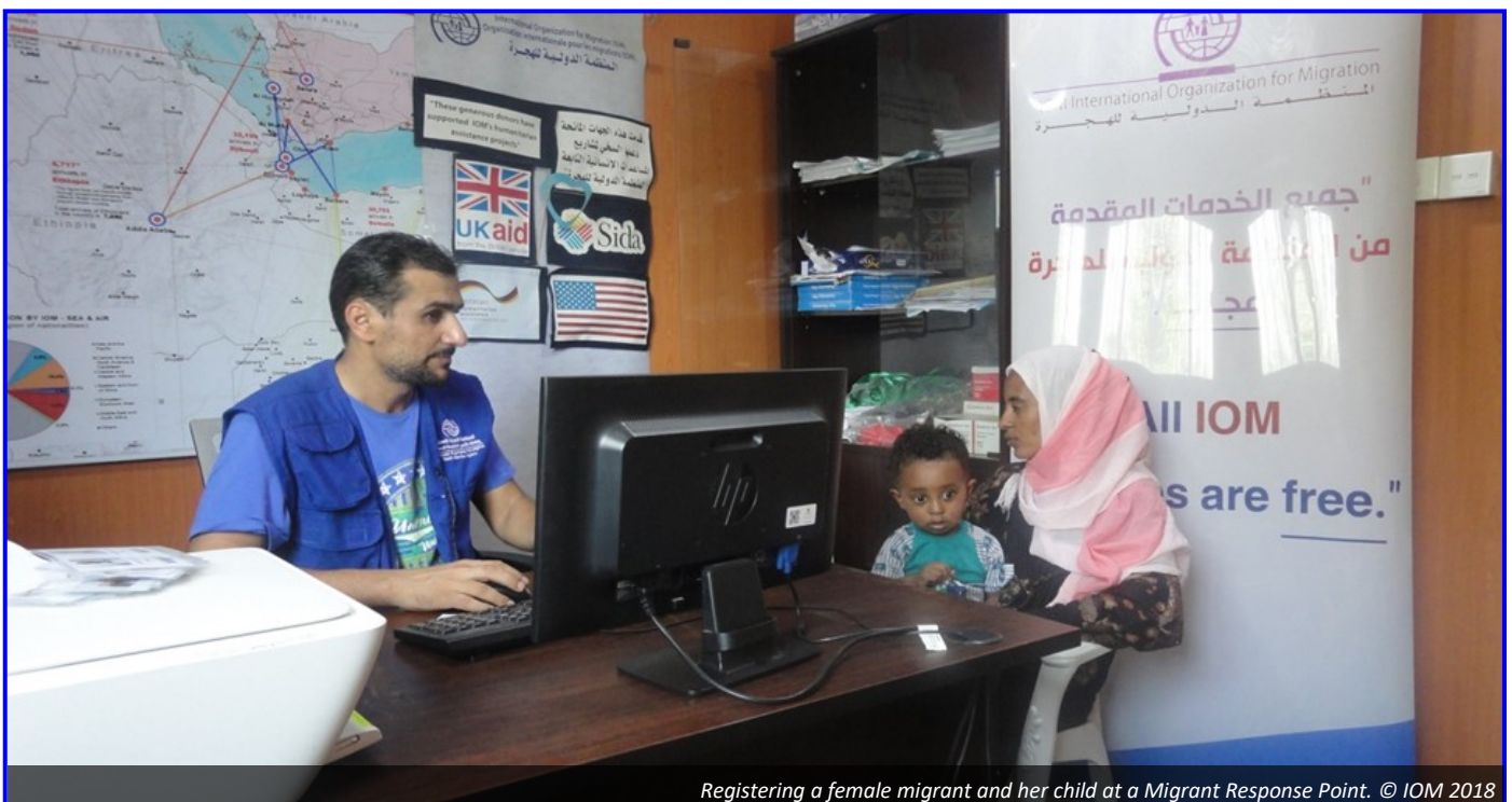
Registering a female migrant and her child at a Migrant Response Point.

A total of 1,782 conflict-affected children (431 girls and 1,351 boys) benefitted from a range of activities—including acting, art, sports, and orientation on recycling and personal hygiene—provided in Child-Friendly Spaces (CFSs) in Sana'a and Aden. In addition, 1 girl and 3 boys were referred to focused PSS.