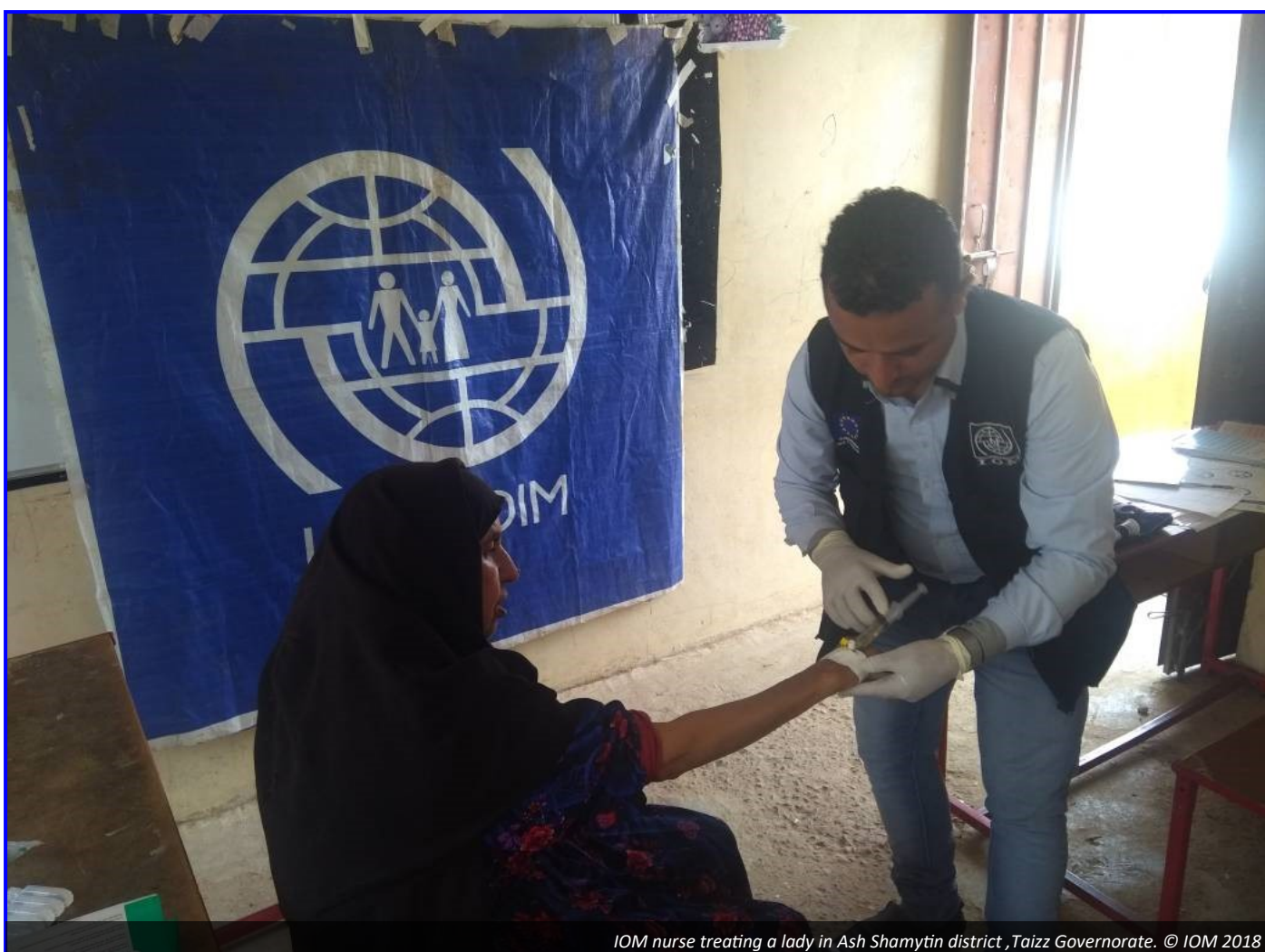
IOM nurse treating a lady in Ash Shamytin district, Taizz Governorate.

Focused psychosocial support services (PSS) was provided to 253 children and their parents – including 99 girls, 139 boys, 14 women, and 1 man – through individual and group sessions conducted in Child Friendly Spaces (CFSs).