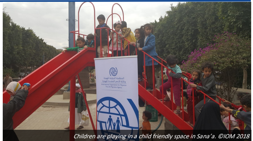
Children are playing in a child friendly space in Sana’a.

A total of 6,196 conflict-affected children (2,178 girls and 4,018 boys) benefitted from a range of psychosocial support activities—including acting, art, sports, and awareness orientation of mine-risks—provided in 34 Child-Friendly Spaces (CFSs) in Sana’a and Aden between 8 and 15 April 2018. In addition, 120 well-trained daily workers were assigned to CFSs with specific responsibilities pertaining to implementing CFS activities.