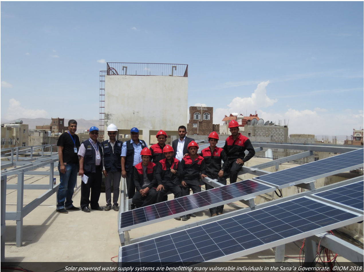
Solar powered water supply systems are benefitting many vulnerable individuals in the Sana'a Governorate.

IOM provides emergency WASH assistance to the most vulnerable to reduce excess morbidity and mortality, and restores and maintains water and sanitation systems towards the improvement of public health. This is achieved by provision of rehabilitation and maintenance of water supply systems, capacity building of WASH stakeholders, water trucking to IDPs, and hygiene promotion activities. 339,000 liters of water are provided to different water points, hospitals, and locations in Lahj, Al-Dhale'e, Abyen, Taizz, and Shabwah Governorates, benefitting over 22,000 individuals on a daily basis .