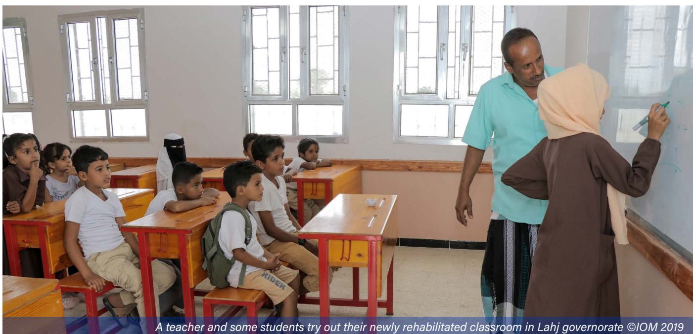
A teacher and some students try out their newly rehabilitated classroom in Lahj governorate

At the start of December, IOM held inauguration ceremonies for Al Qadesia and Al Thawra schools in Lahj governorate. IOM rehabilitated a total of four schools in Lahj in 2019, giving 1,918 students and 245 teachers an improved learning environment. Also, in December, IOM in partnership with FAO commenced inception level activities for the Hadramaut-based project: Water for Peace in Yemen: Strengthening the Role of Women in Water Conflict Resolution and Climate Change Mitigation. This included preliminary stakeholder mobilization and preparations for an inception workshop to be held in January 2020.