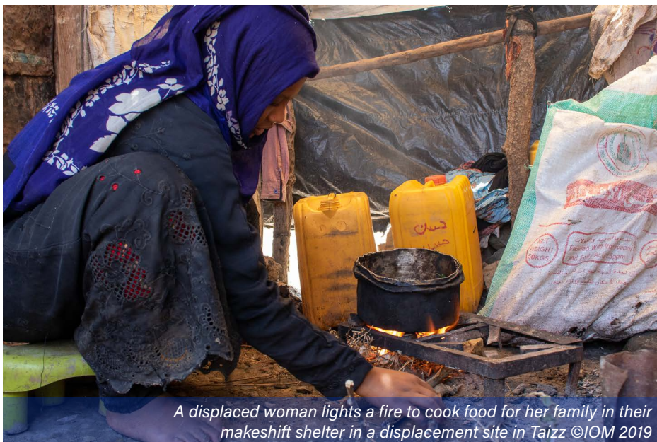
A displaced woman lights a fire to cook food for her family in their makeshift shelter in a displacement site in Taizz