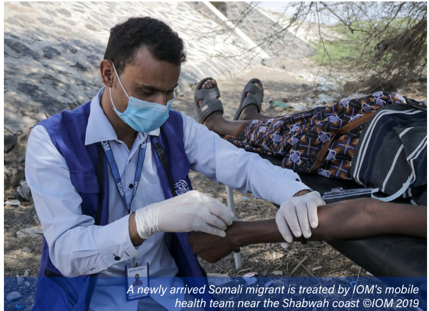
A newly arrived Somali migrant is treated by IOM's mobile health team near the Shabwah coast