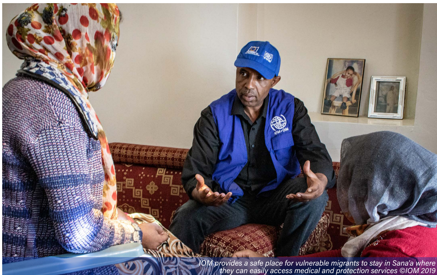
IOM provides a safe place for vulnerable migrants to stay in Sana'a where they can easily access medical and protection services