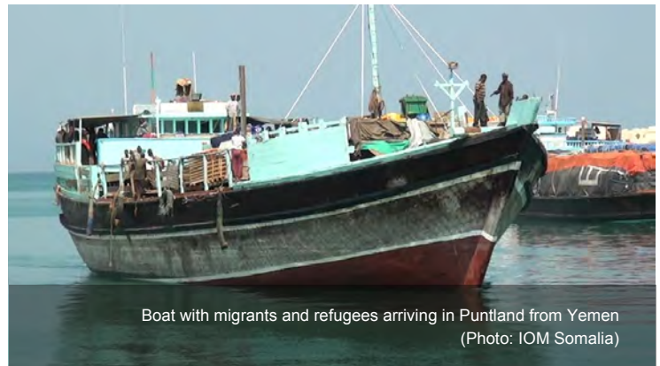
Boat with migrants and refugees arriving in Puntland from Yemen

Port of Bossaso. These are mostly Somali nationals as well as Yemen nationals.