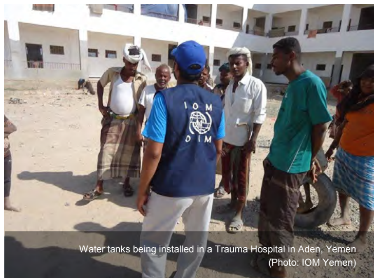
Water tanks being installed in a Trauma Hospital in Aden, Yemen

In Aden and Lahj, IOM health teams are based in the public health facilities where most of the casualties are being received. Nine IOM physicians and six nurses are based at the "22 May" Hospital, the "Alqatei" Health Center in Aden as well as the "Alwihat" Hospital in Lahj. In Aden, IOM is assisting Médecins Sans Frontières teams at their surgical center to address the overwhelming numbers of in-patients requiring surgery urgently.