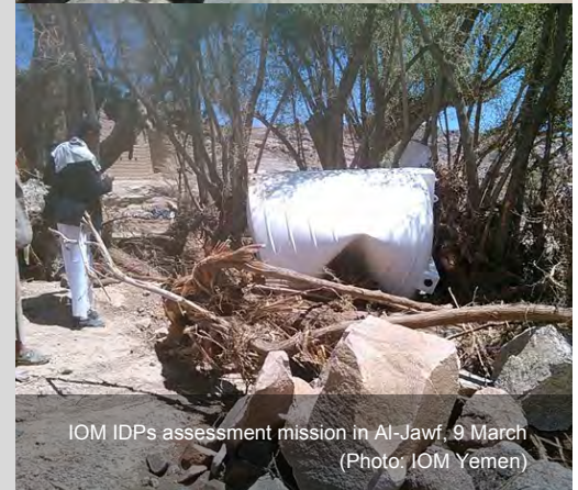
IOM IDP's assessment mission in Al-Jawf, 9 March