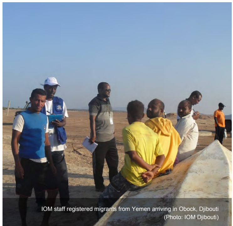
IOM staff registered migrants from Yemen arriving in Obock, Djibouti

On 4 April, IOM Somalia received an official communiqué from the Federal Government of Somalia requesting assistance with the evacuation of Somali nationals from Yemen. Discussions are ongoing with UNHCR to assist this vulnerable group of people. Nearly 240,000 Somali refugees are currently estimated to be living in Yemen. IOM and UNHCR are currently in discussions to determine the most appropriate course of action in relation to this large group, who is currently particularly vulnerable to ongoing violence in Yemen.