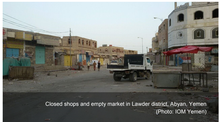
Closed shops and empty market in Lawder district, Abyan, Yemen

On 22 April, IOM started daily water trucking for IDPs and host communities in Al Dhubayiat area (10,000 of liter per day). This is the first humanitarian intervention since the escalation of conflict in the area. Al Dhale'e has had no water and electricity for over one month.