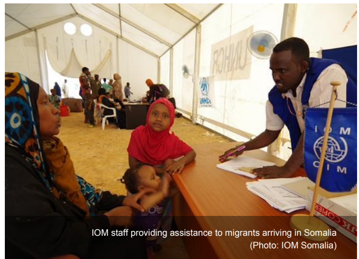
IOM staff providing assistance to migrants arriving in Somalia

In Puntland, the total number of arrivals is 1,132. IOM continues to coordinate with the government and members of the Yemen Task Force for transit from sea port to reception center in Bosasso. IOM is also providing water and dates for new arrivals at the port. Additionally, IOM has supported 26 migrants with onward transportation from Bosasso on 22 April. Further IOM is now responsible for all WASH activities at the reception center in Bosasso. An April 20th attack on a UN vehicle in Garowe has added strain to the already complex operation for the government and humanitarian actors in Puntland, but has not diminished assistance to arrivals.