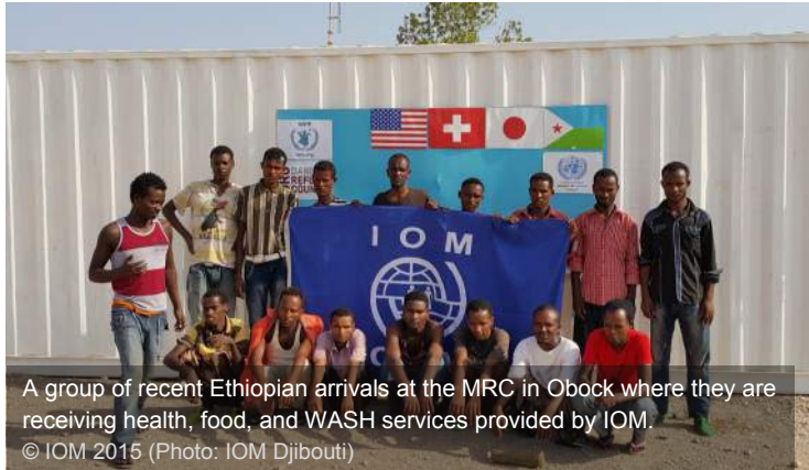
A group of recent Ethiopian arrivals at the MRC in Obock where they are receiving health, food, and WASH services provided by IOM.

Improvements to the WASH facilities at the MRC continue, with 10 showers and 10 toilets currently undergoing construction. In addition, WFP and IOM have signed an agreement for WFP to handle the future provision of food to arrivals at the MRC effective immediately. Through the signing of the agreement, this new partnership will assist in increasing the efficiency of IOM operations at the MRC.