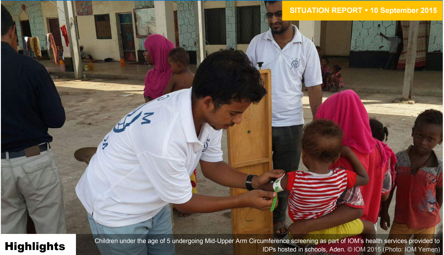
Children under the age of 5 undergoing Mid-Upper Arm Circumference screening as part of IOM's health services provided to IDPs hosted in schools, Aden.