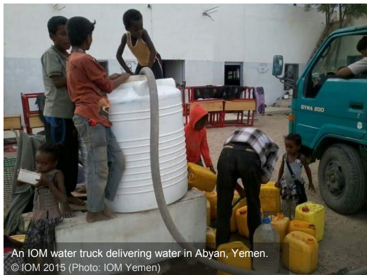
An IOM water truck delivering water in Abyan, Yemen.

IOM also provided 72,000 liters of water to a total of 12 water sites in Al Makhzan Al Sharqi and Al Makhzan Al Gharbi areas in Khanfir, Mihraq, Jaar, and Kadmat bin Lawar areas reaching approximately 5,915 individuals.