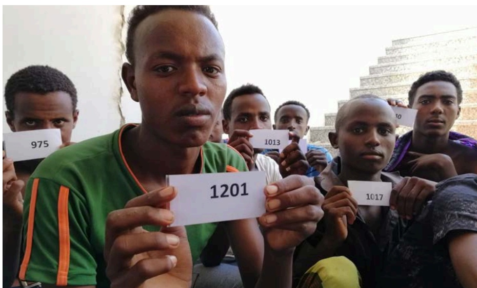
MIGRANTS AT 22ND MAY STADIUM WAIT TO BE MEDICALLY SCREENED & DEEMED "FIT TO TRAVEL".