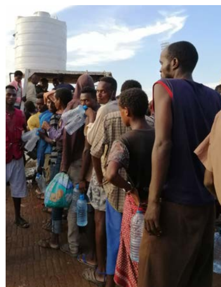
MIGRANTS QUEUE FOR WATER. PHOTO: MOORE/IOM 2019