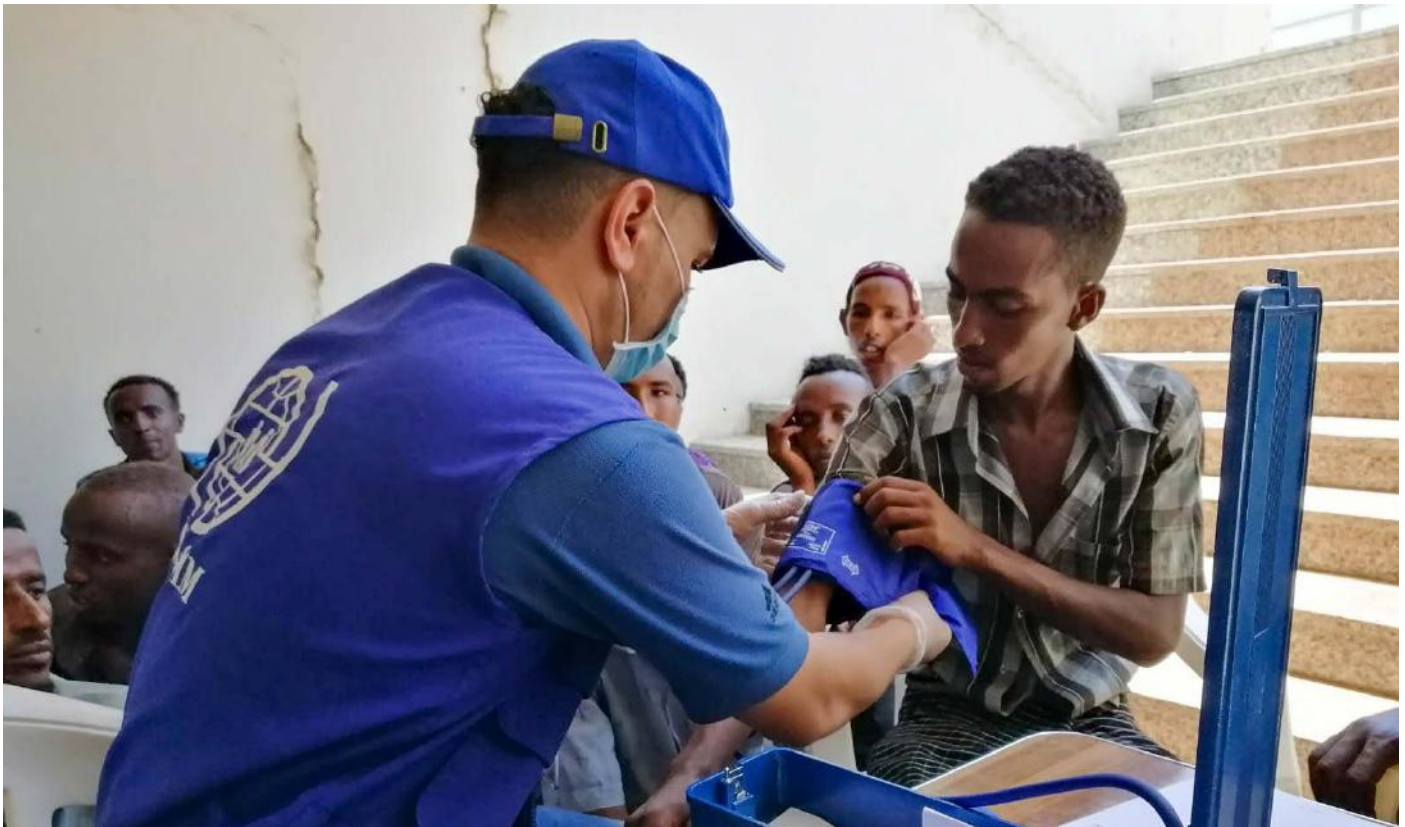
A DETAINED MIGRANT IS SCREENED BY IOM'S HEALTH TEAM TO ENSURE HE IS FIT TO TRAVEL TO ETHIOPIA UNDER IOM'S VOLUNTARY HUMANITARIAN RETURN PROGRAMME.