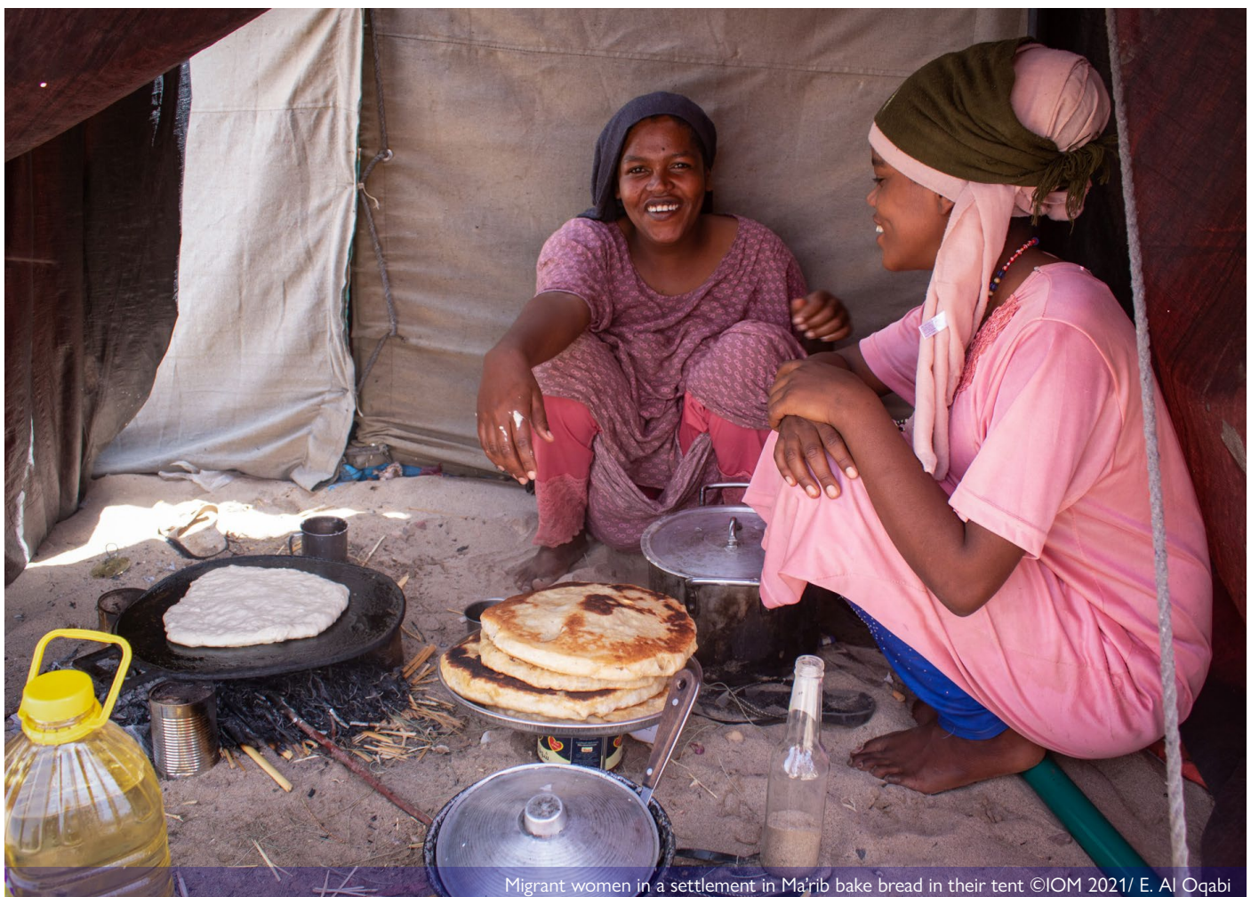
Migrant women in a settlement in Ma'rib bake bread in their tent

At the same time, overcrowding in migrant hosting sites and a general rise in tension between the migrants and with the host community persist. In this context, protection concerns for stranded migrants are mounting, and many are seeking options to return home. IOM is providing WASH, protection, health and shelter services, and continuing small-scale food distributions, but the Organization cannot cover all needs. Humanitarian partners working in food security in particular are needed to assist migrants, currently stranded migrants do not have access to the same food assistance as IDPs and migrants have limited alternatives for their food security.