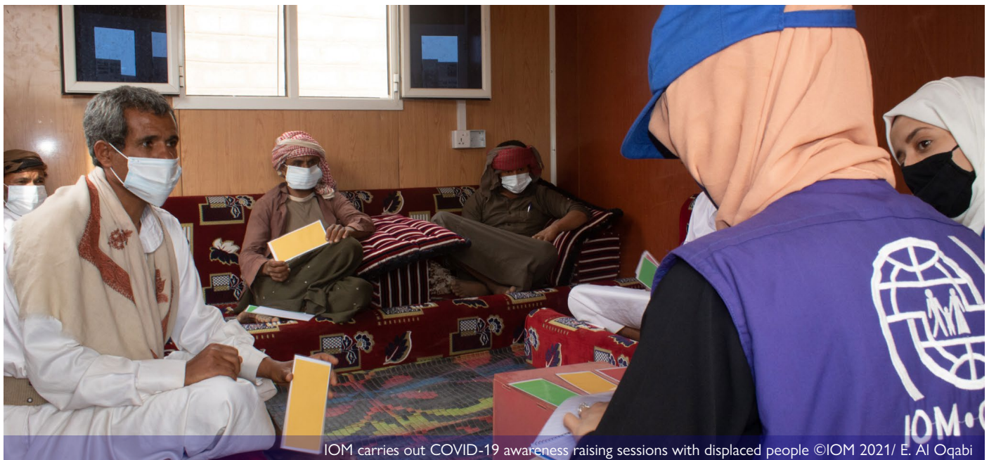
IOM carries out COVID-19 awareness raising sessions with displaced people