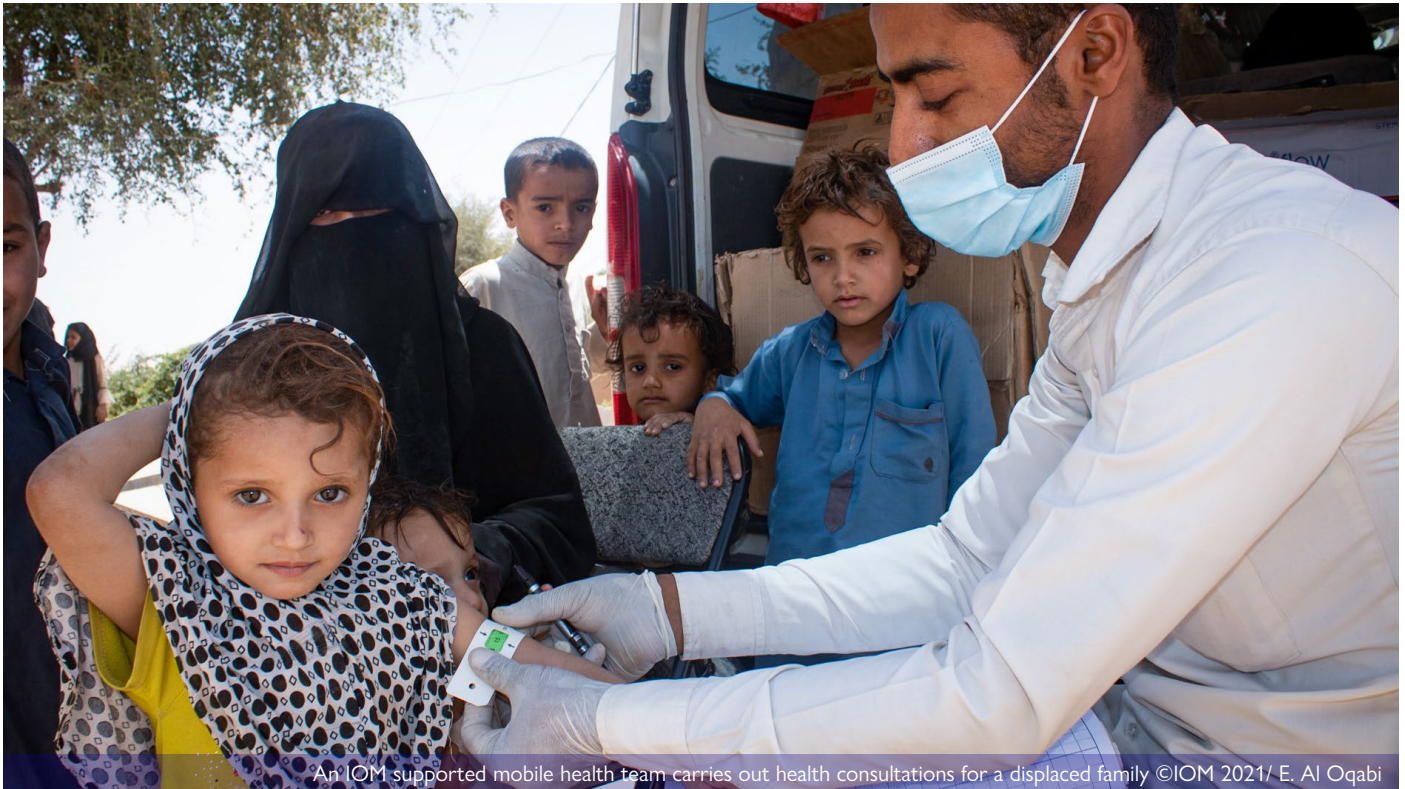
An IOM supported mobile health team carries out health consultations for a displaced family