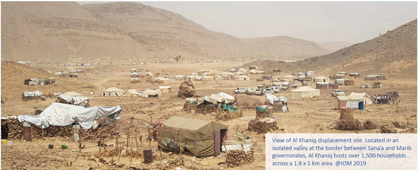
View of Al Khaniq displacement site. Located in an isolated valley at the border between Sana'a and Marib governorates, Al Khaniq hosts over 1,500 households across a 1.8 x 1 km area.