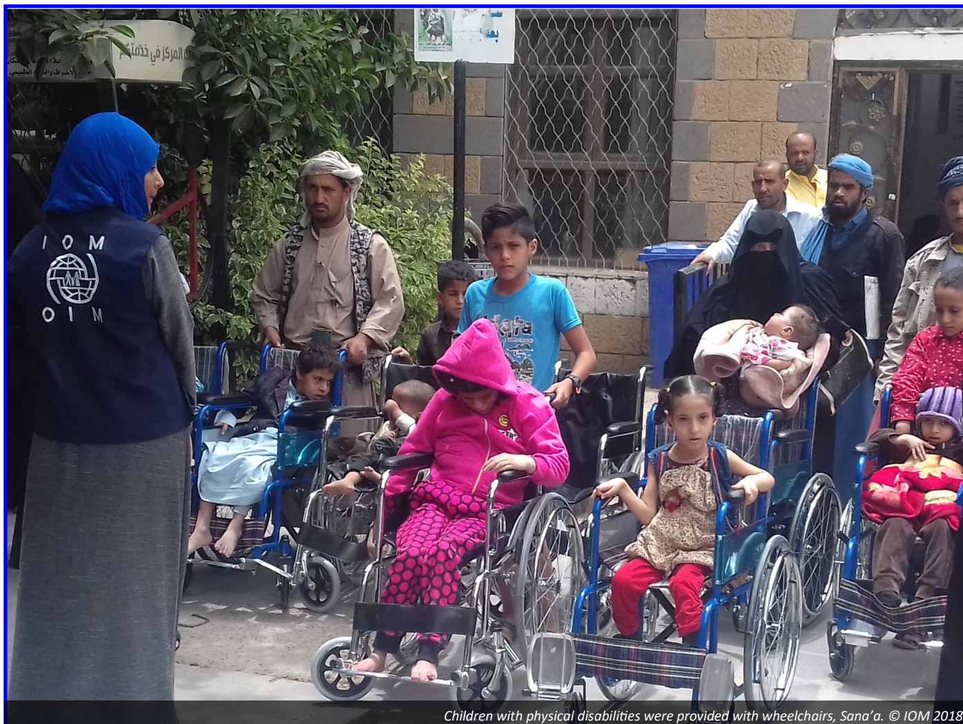
Children with physical disabilities were provided with wheelchairs, Sana'a.