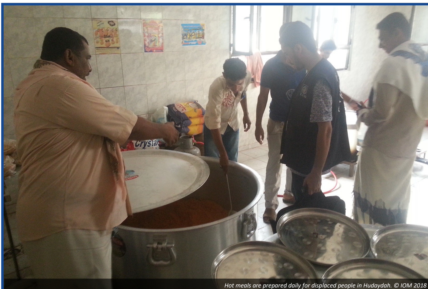
Hot meals are prepared daily for displaced people in Hudaydah.