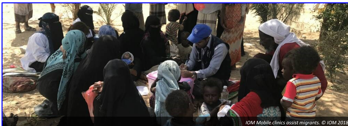
IOM Mobile clinics assist migrants.