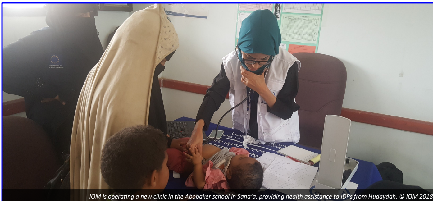
IOM is operating a new clinic in the Abobaker school in Sana'a, providing health assistance to IDPs from Hudaydah.