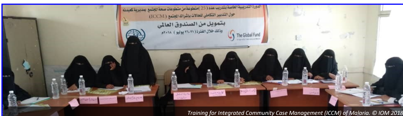
Training for Integrated Community Case Management (ICCM) of Malaria.