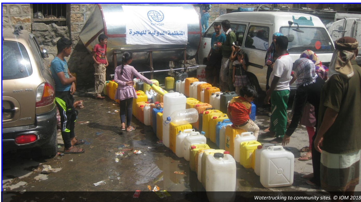
Watertrucking to community sites.

IOM continues to deliver 273,000 litres of water daily to different water points, hospitals and locations in Lahj, Al-Dhale'e, Abyan, Taiz and Shabwah to support approximately 15,503 beneficiaries.