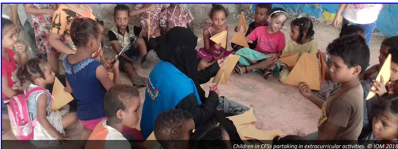
Children in CFSs partaking in extracurricular activities.

A total of 1,586 conflict-affected children (582 girls and 1,004 boys) benefitted from awareness raising activities provided in CFSs in Sana'a and Aden. Among them, 27 children received focused PSS. In Aden, a mobile space was opened in Al-Gharbani school in the directorate of Kraytar. All CFSs were preparing to celebrate the International Day against Trafficking in Persons, with many games and events organized for the children.