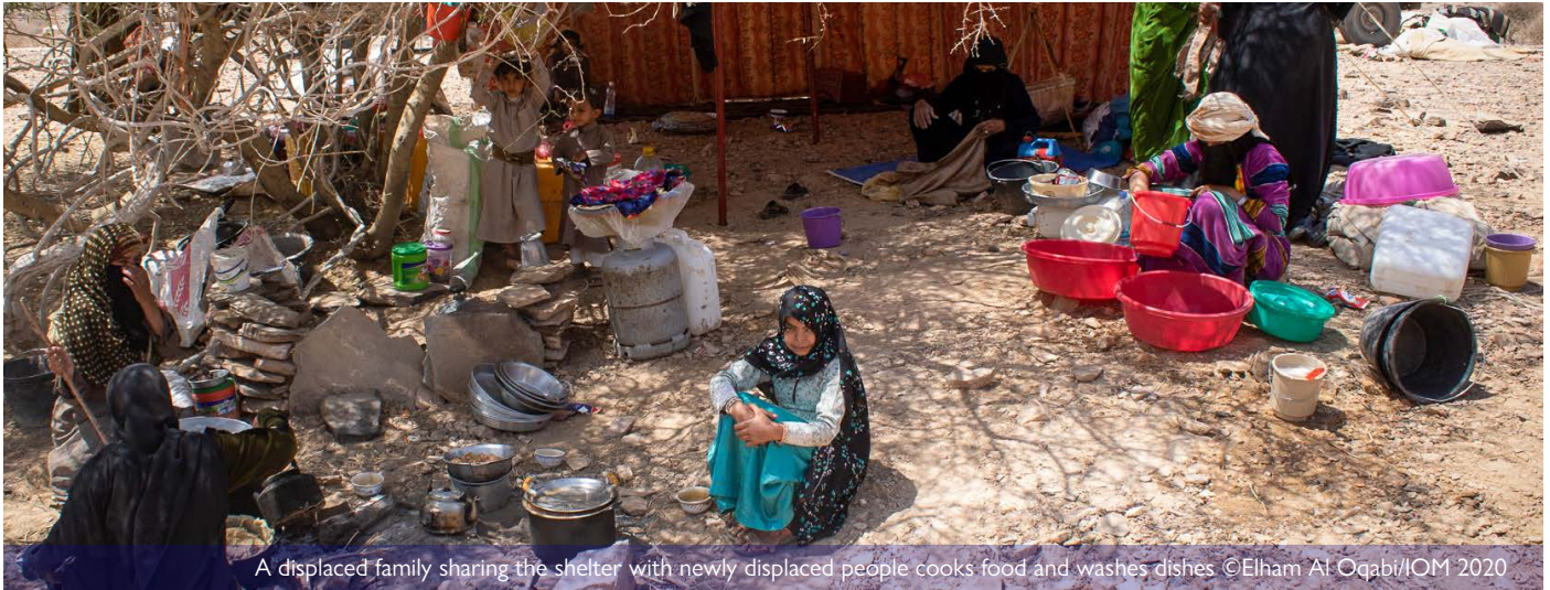
A displaced family sharing the shelter with newly displaced people cooks food and washes dishes.