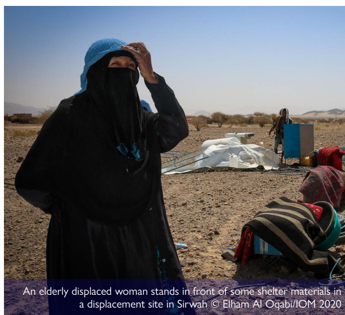
An elderly displaced woman stands in front of some shelter materials in a displacement site in Sirwah

The escalating conflict in parts of Ma'rib is forcing more and more people to flee their homes. Newly displaced persons are mainly arriving from IDP hosting sites in other parts of Sirwah – Al Zur, Dhanah Al Sawabin, and Danah Al Hayal sites. For the most part, IDPs have moved into Al Rawdah IDP site in Sirwah likely because of its proximity to their locations of origin, family connections here and overcrowding in Marib city. A majority of IDPs have been displaced multiple times and report fatigue and uncertainty over repeated movements. Prior to the recent displacement Al Rawdah Sirwah IDP site hosted an estimated 677 HH in a large, flat rocky area between two mountain ranges near Ma'rib Dam – today the camp population is close to two times that size. Al Rawdah is to the east of the lake that was formed by Ma'rib Dam, the IDPs moved from the western side where their camps were located. The road between Al Rawdah Sirwah and Ma'rib city cuts through a gap in a mountain range, and while checkpoints are positioned here, they have not imposed any movements restrictions to Al Rawdah thus far.