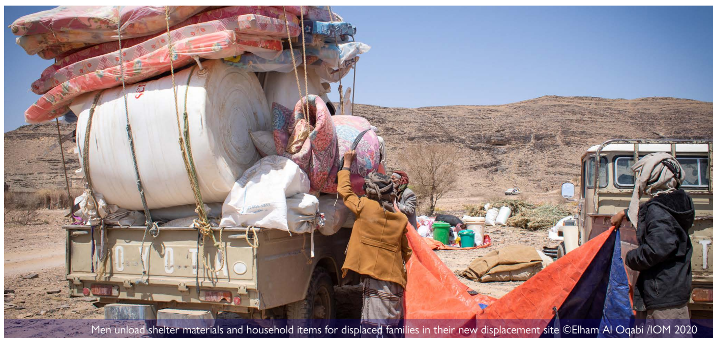
Men unload shelter materials and household items for displaced families in their new displacement site