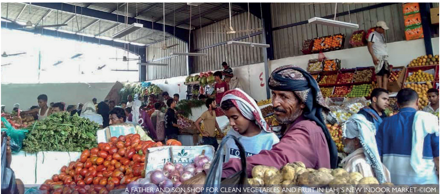
A FATHER AND SON SHOP FOR CLEAN VEGETABLES AND FRUIT IN LAHJ'S NEW INDOOR MARKET

Before the market rehabilitation, sellers used outdoor stalls where fruit and vegetables would quickly spoil because of heat, overcrowding and unhygienic conditions. Now with the new indoor market, sellers and consumers enjoy a clean, well-ventilated indoor space. The space includes sinks and a drainage system to allow sellers to wash the vegetables and clean their space at the end of the day.