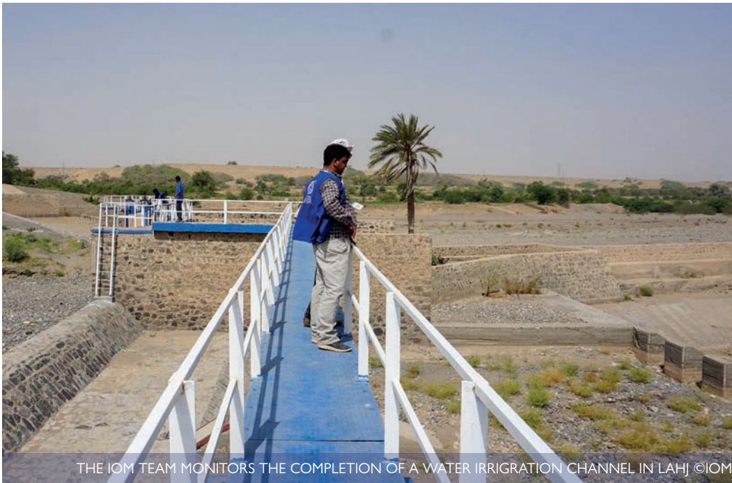
THE IOM TEAM MONITORS THE COMPLETION OF A WATER IRRIGATION CHANNEL IN LAHJ