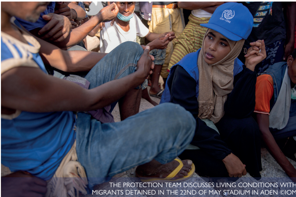
THE PROTECTION TEAM DISCUSSES LIVING CONDITIONS WITH MIGRANTS DETAINED IN THE 22ND OF MAY STADIUM IN ADEN

In April, authorities began detaining large groups of migrants in Abyan, Aden and Lahj governorates. At the peak of the campaign, approximately 5,000 migrants, including children and women, were held across three sites unfit to accommodate people like conflict-damaged sports stadiums. In coordination with partners, IOM immediately began an emergency response for those detained, providing food, water supply, latrines and health care. IOM and partners undertook protection assessments to identify cases with specific vulnerabilities, coordinating referrals to UNHCR and other partners, and supporting children and women's safety on site. Just over a month into the situation, IOM began