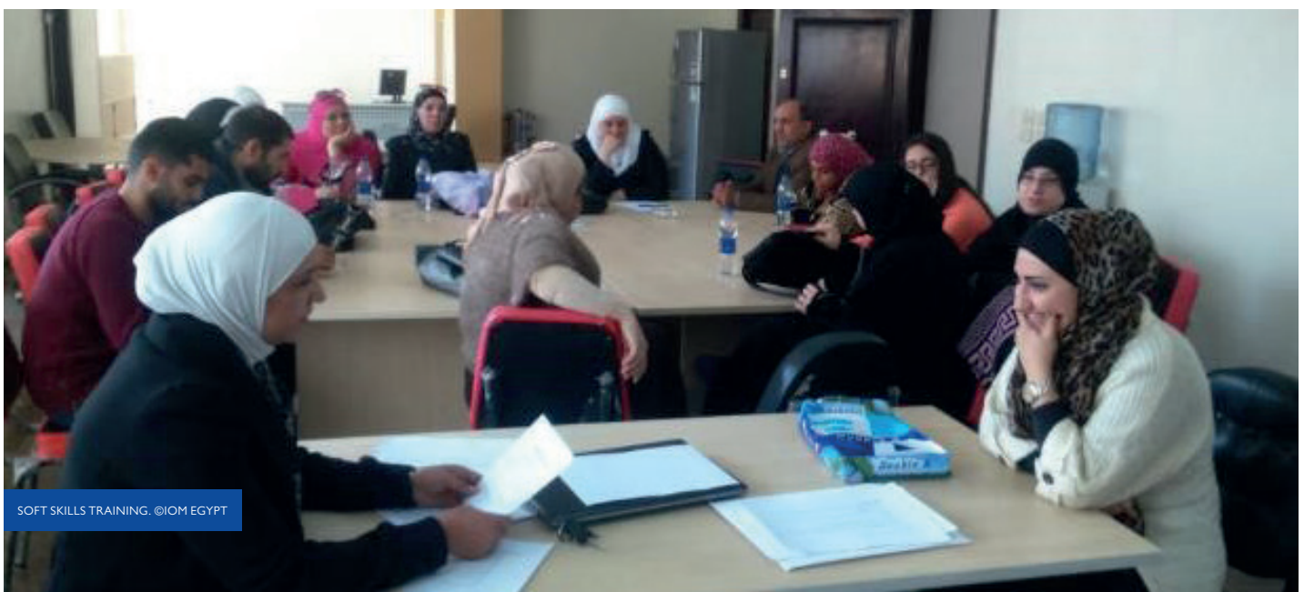
SOFT SKILLS TRAINING.