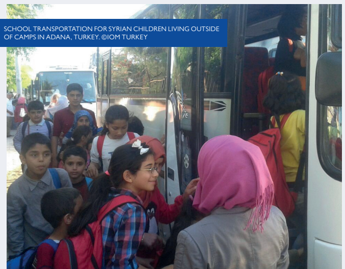
SCHOOL TRANSPORTATION FOR SYRIAN CHILDREN LIVING OUTSIDE OF CAMPS IN ADANA, TURKEY.