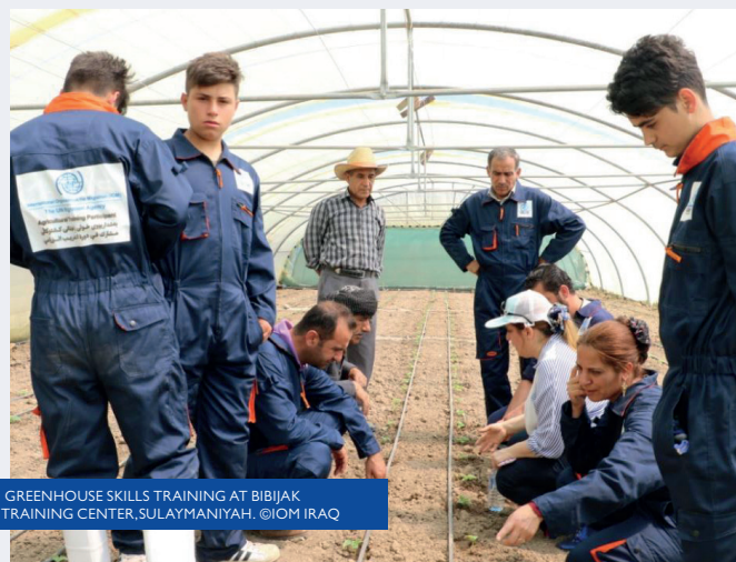
GREENHOUSE SKILLS TRAINING AT BIBIAK TRAINING CENTER, SULAYMANIYAH.

FUNDING REQUESTED 5,331,744 $ RECEIVED 984,480 $