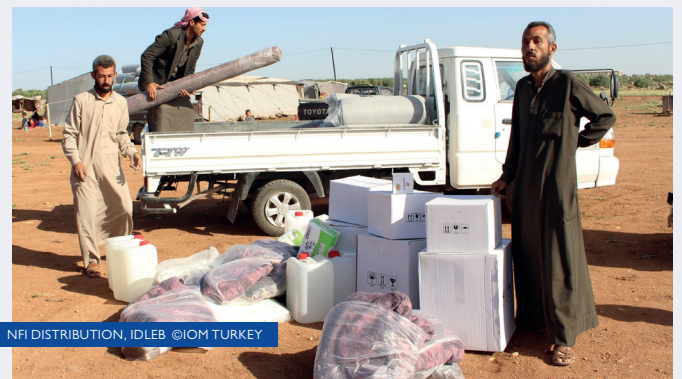
NFI DISTRIBUTION, IDLEB

TARGET DISPLACED SYRIANS AND HOST COMMUNITIES BENEFICIARIES ASSISTED 792,671