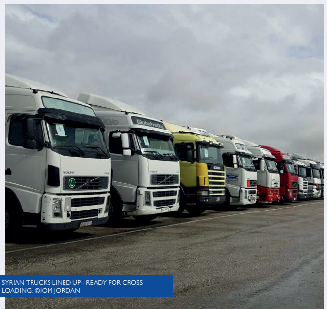
SYRIAN TRUCKS LINED UP - READY FOR CROSS LOADING.