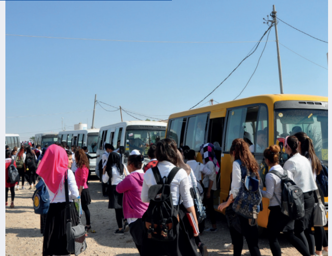
STUDENT TRANSPORTATION ACTIVITY, DOMIZ CAMP, DOHUK.

FUNDING REQUESTED 722,258 $ RECEIVED 103,973 $