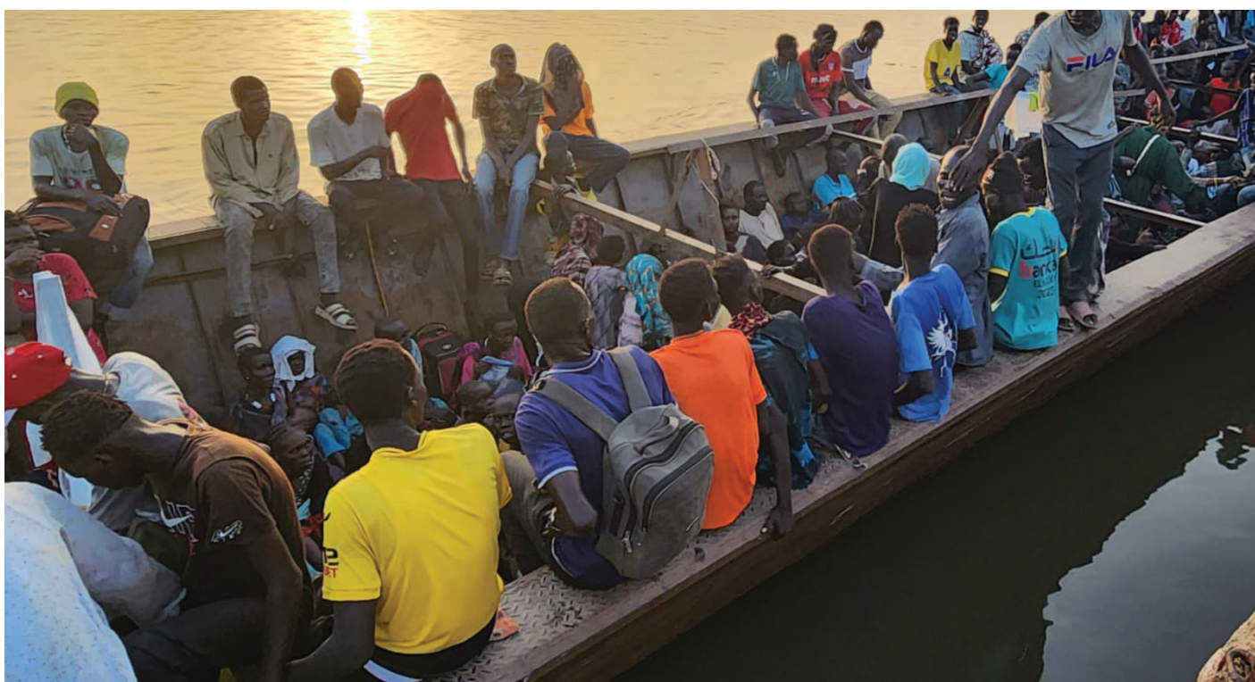
First boat using the voucher scheme departing from Renk enroute to Malakal

1,701 386 20,000 4,029 Returnees Provided with Transportation Assistance TCNs Supported Returnees Screened at Border Points Supported Vulnerable People Referred for Assistance