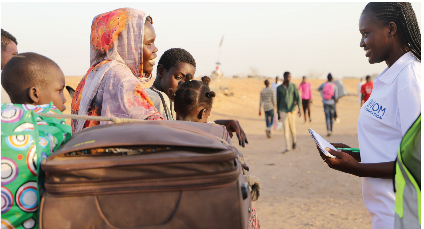
Returnees receiving life-saving assistance at the Juda border, © IOM May 2023

DTM has also deployed a team to Am Dafouk to carry out a flow monitoring survey following reports of new arrivals through the border. To date, 9,823 new arrivals are estimated, 65% of whom are Sudanese and 35% are Central African returnees – UNHCR has yet to release official figures on this. IOM will gradually extend its flow monitoring activities to other entry points in Sudan as the situation progresses, however with the upcoming rainy season, Am Dafouk and other border areas may no longer be available.