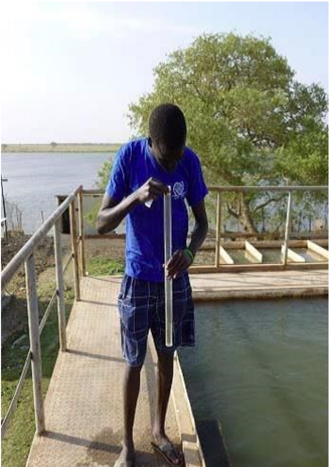
A water quality test is conducted at the water treatment plant in Melut.