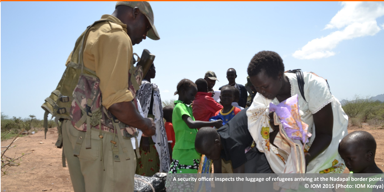
A security officer inspects the luggage of refugees arriving at the Nadapal border point.