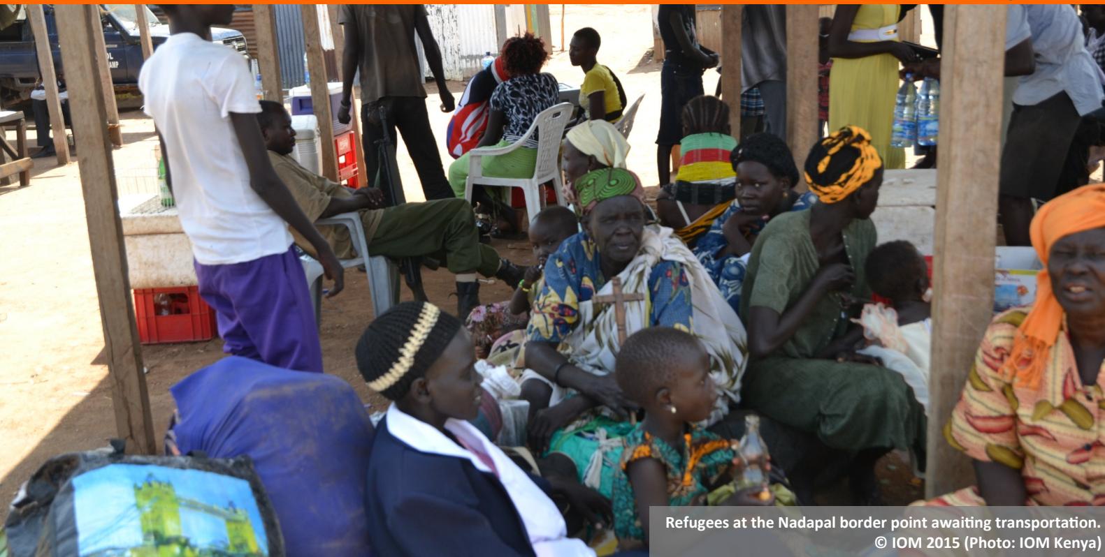
Refugees at the Nadapal border point awaiting transportation.