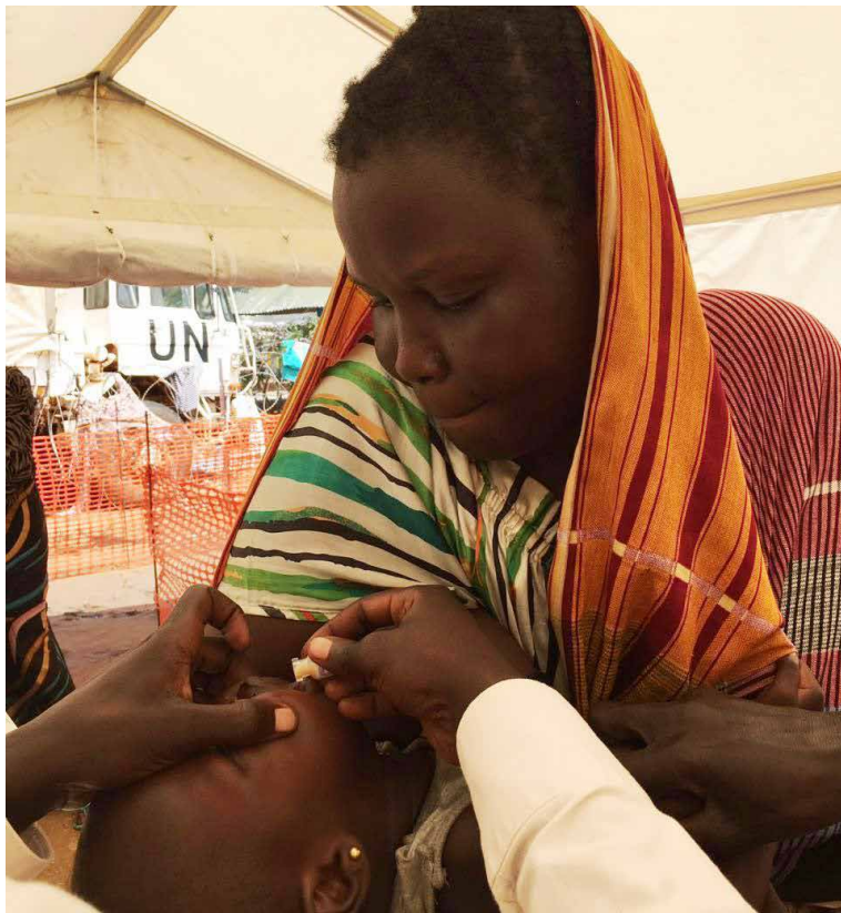
A child receives an oral cholera vaccination at the IOM health clinic at the UNMISS base in Tong Ping

IOM is providing primary health care to newly displaced civilians at the UNMISS base in Tong Ping and is directly responding to the Cholera outbreak recently declared in Juba. While rapidly scaling up in Juba, IOM has continued to provide critical health services to displaced people in Wau Town and has maintained lifesaving assistance at the UN protection of civilian sites in Bentiu, Malakal and in Renk town.