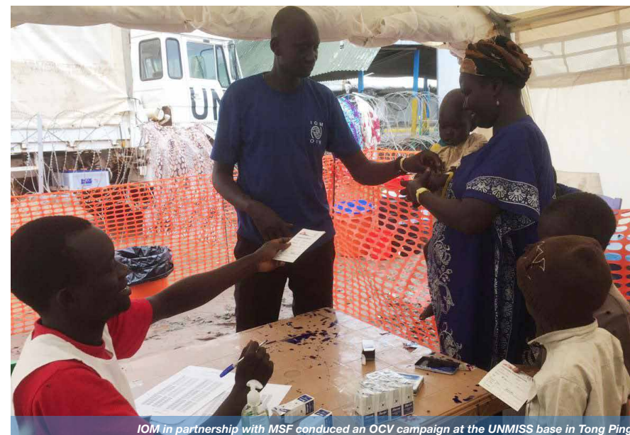
IOM in partnership with MSF conducted an OCV campaign at the UNMISS base in Tong Ping