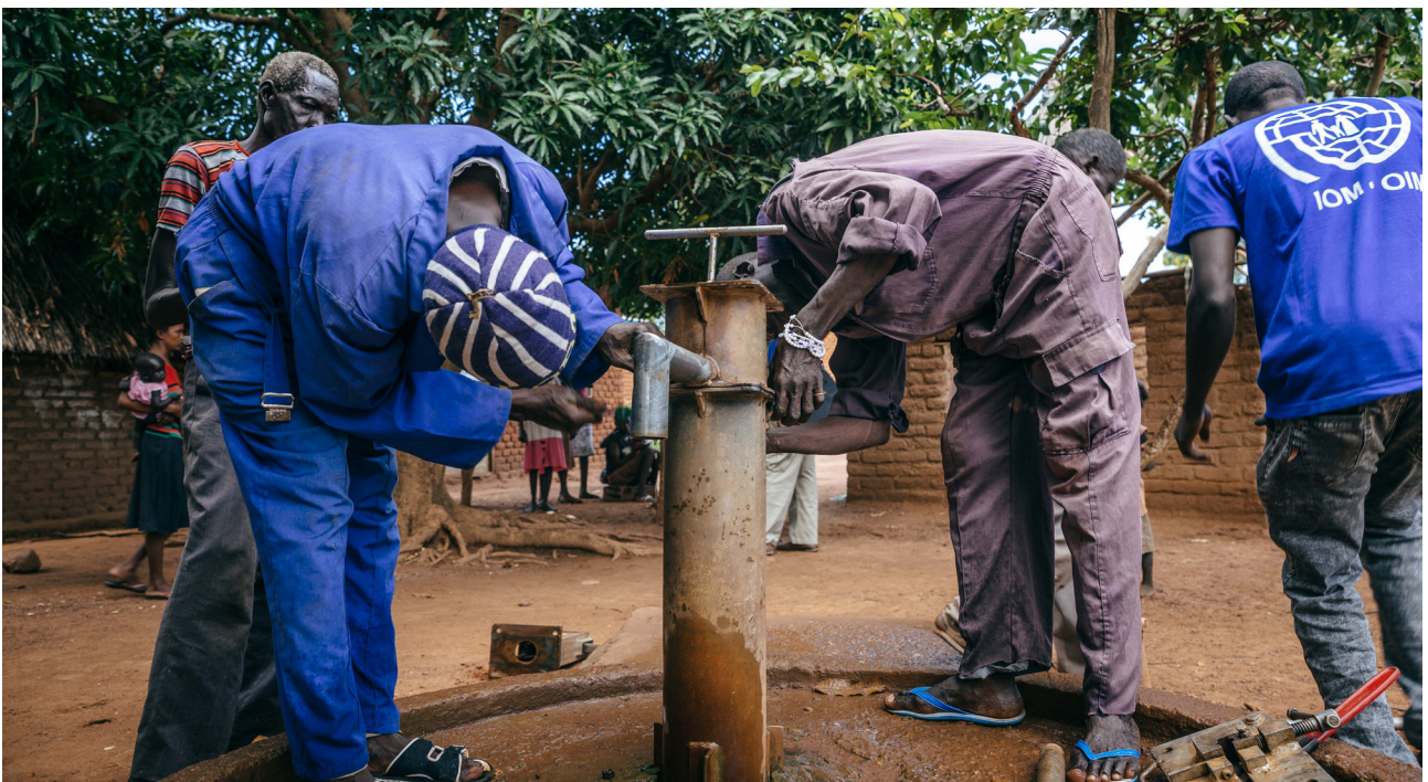
IOM and community volunteers repair a broken borehole in Wau south.

In addition to providing water and hygiene assistance in displacement sites in South Sudan, IOM's WASH teams deploy to towns and remote areas to ensure displaced and conflict-affected populations have access to safe drinking water. In recent weeks, IOM has worked with local communities to repair boreholes in areas surrounding Bentiu town and locations south of Wau town. Rehabilitation efforts often involve strong community participation, building capacity and supporting long-term maintenance of the boreholes.