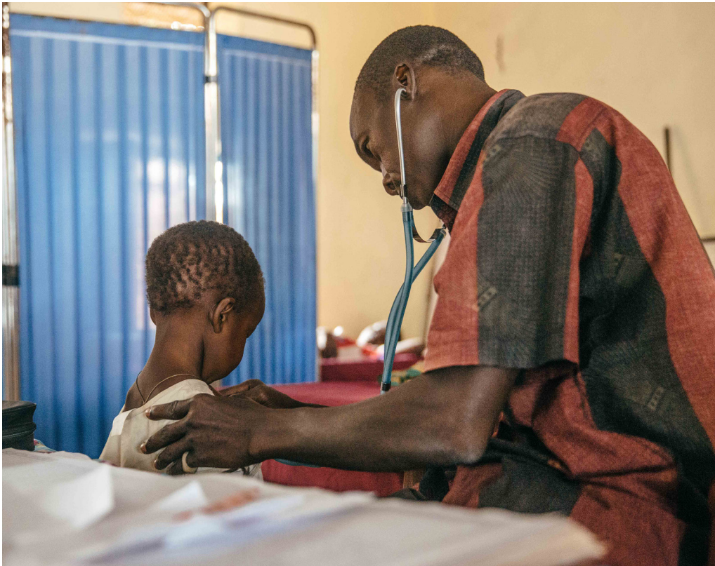
A clinician checks the breathing and heartbeat of a young boy at an IOM mobile clinic in Wau. IOM/Mohammed 2016

IOM teams continue humanitarian activities across South Sudan, where more than 6.1 million people are in need of assistance. Since December 2013, the crisis has displaced 2.3 million people, including 751,400 who have fled to neighbouring countries and more than 1.61 million others who remain internally displaced.