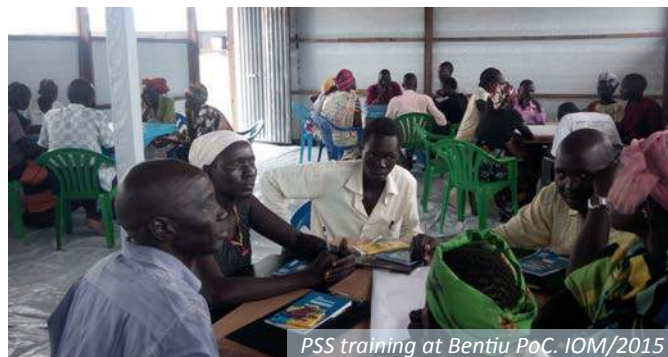
PSS training at Bentiu PoC.

With IOM's support, IDPs in Bor continue to participate in seven PSS mobile teams, including an educators group, a women's group, a sports group, a cultural group, a mediation group, an interfaith group and a group of lay counsellors. Last week, the mediation group facilitated a discussion with the IDP community regarding movements outside of the PoC site and associated risks.