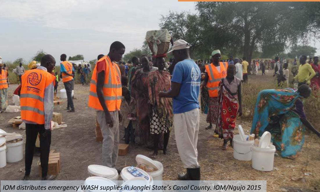
IOM distributes emergency WASH supplies in Jonglei State's Canal County.

IOM trains IDPs on psychosocial support at the Bentiu PoC site