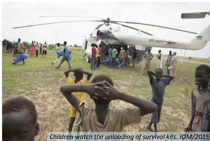
Children watch the unloading of survival kits.

IOM staff both deploy on survival kit operations and help assemble/coordinate the delivery of survival kits from Rumbek, Lakes State.