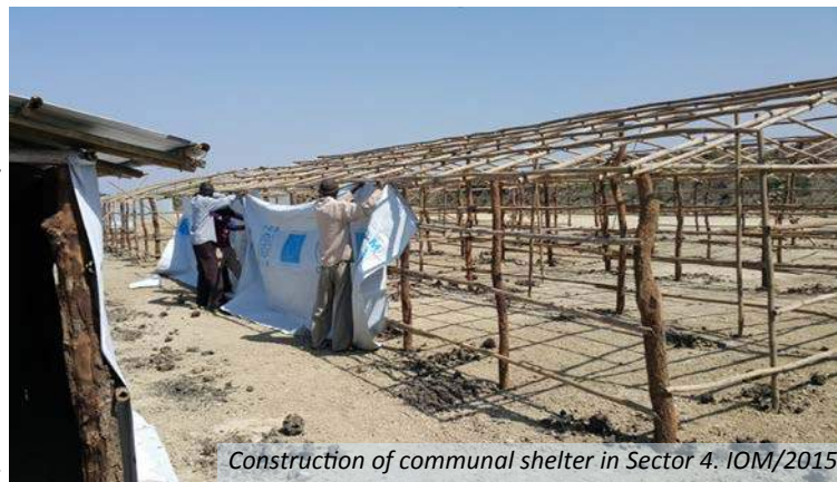
Construction of communal shelter in Sector 4. IOM/2015

IOM is supporting camp manager Danish Refugee Council (DRC) and UNMISS to prepare for the relocation of IDPs from crowded PoCs 3 and 4 to the new contingency area/Sector 4. Relocations remain on hold as additional security arrangements are implemented.