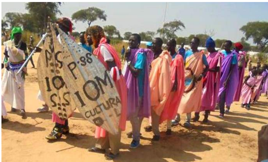
Bor PoC members perform dances during the World Mental Health day event.

Assistance to help women participate in the Sports Group was also discussed this week. When childcare was pointed out as a challenge, it was decided that one of the facilitators would look after the children at the PSS space while mothers attended volleyball activities.