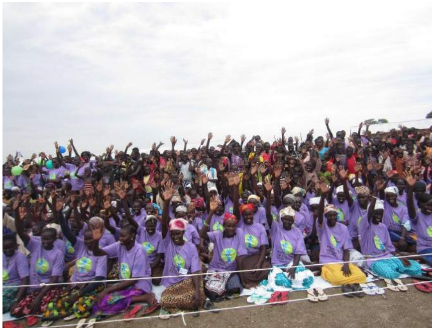
Enjoying celebrations at the Global Handwashing Day.