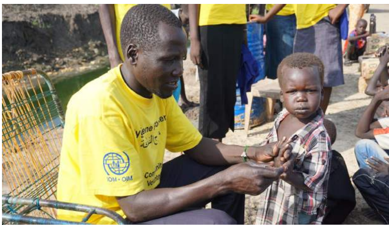
Hygiene Promoters teach children good handwashing techniques.

From 5 - 21 October, staff at IOM health clinics performed 3,949 consultations, including treating 1,819 malaria cases and 1,483 people for upper respiratory infections. IOM vaccinated 296 children under five against common diseases, with 81 births assisted by the team. The Rapid Response Team for Health also provided surge capacity at IOM clinics in the PoC.