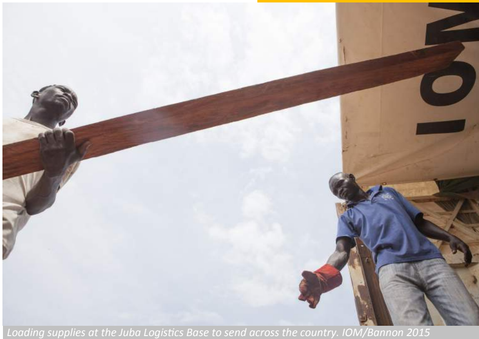
Loading supplies at the Juba Logistics Base to send across the country. IOM/Bannon 2015