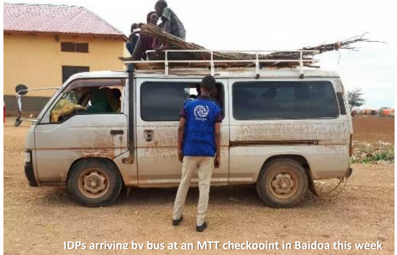
IDPs arriving by bus at an MTT checkpoint in Baidoa this week