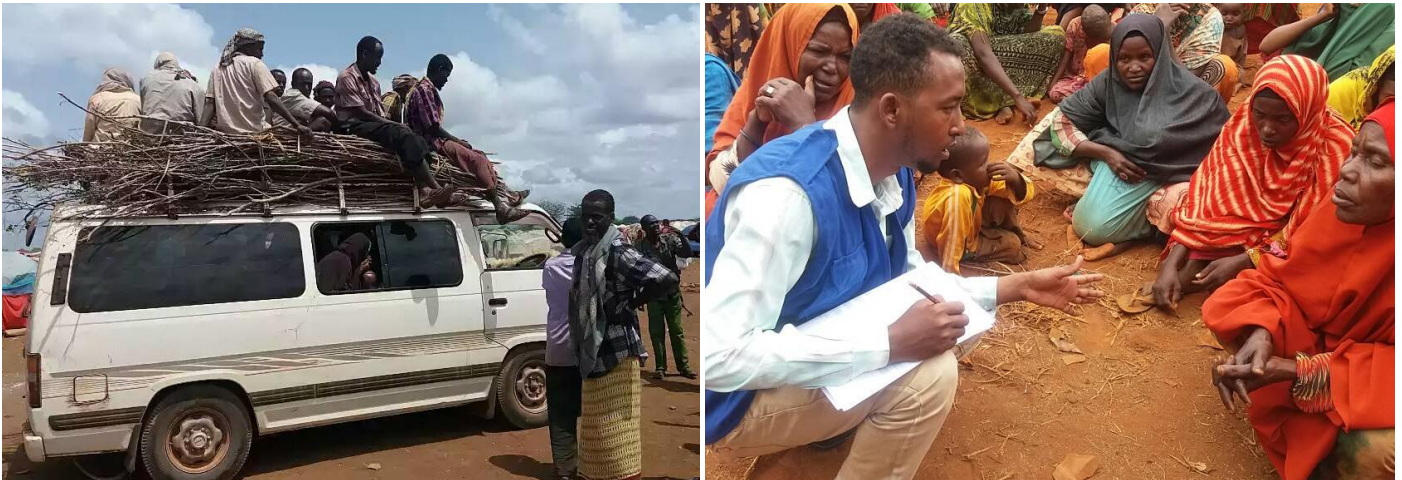
IOM MTT enumerators identify new arrivals passing through the Baidoa checkpoints with luggage, and conduct interviews with the heads of household.

MTT aims to complement existing information management products on displacements and movements in Baidoa, by providing site level specific data on population movements on a regular basis, to assist agencies operating in sites and settlements with key information on: demographics of movement, area of origin, area of return/onward movement, reasons for movement and movement trends over time.