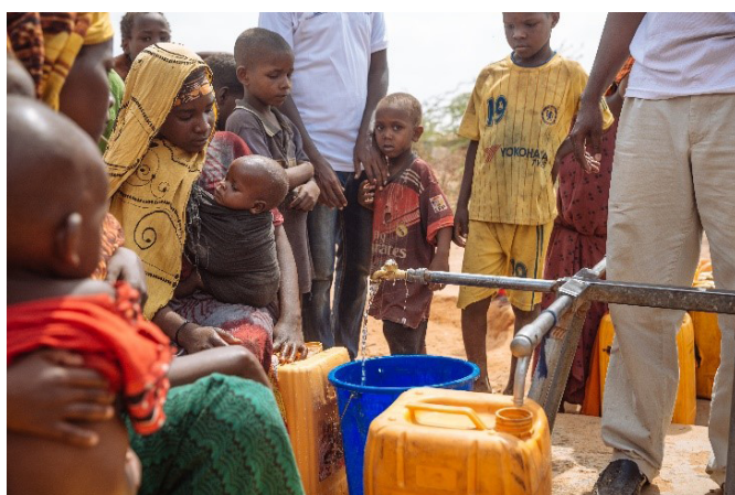
Internally displaced persons at a water point in Doolow.

In total, from January to September 2017, IOM has provided 212,719,940 litres of clean and safe water to 568,749 beneficiaries through water trucking in eight regions. IOM also provided sustainable access to water through operational and maintenance support of permanent water sources, including strategic boreholes and shallow wells, which served over 385,958 people. IOM provided hygiene kits and raised awareness on positive health and hygiene practices among an estimated 563,777 people in the same timeframe.