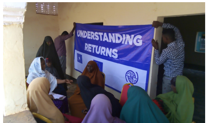
DTM initiating a Focus Group Discussion on understanding returns in Kismayo

IOM Somalia's Displacement Tracking Matrix (DTM) strives to provide localized, up-to-date information on displacement figures and trends in drought-affected areas, as well as the basic needs of the target population. In September, DTM held a Focus Group Discussion in Kismayo under the EU Reinteg programme. Multiple beneficiaries discussed the concept of returning refugees where key returnees concerns were highlighted. DTM also conducted the Roud 6/Phase 2 scale up training in Badhadhe district on September 13 to 15 where 6 enumerators were trained and finished Phase 2 scale up training in Puntland which covered 9 districts (Caluula, Laasqoray, Badhan, Dhahar, Taleex, Buhoodle, Galdogod, Burtinleand & Jariiban). A total of 54 (45 males and 9 females) enumerators were trained. Flow monitoring data collection is currently underway in the new districts (Berbera, Zeylac, Doolow, Belet Xaawo, El wak, Dhoble, Tulo barwako and Diff in middle and lower Juba).