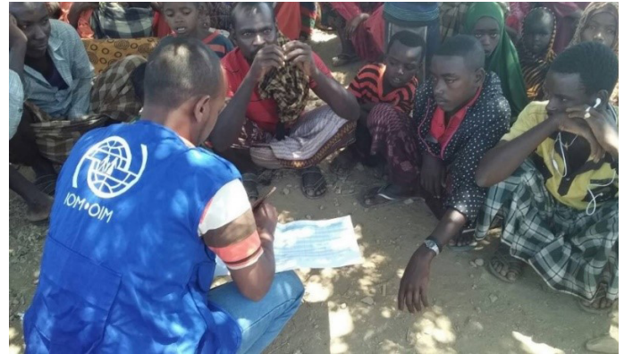
IOM registering internally displaced people for the movement tracking trend in Baidoa

IOM's Camp Coordination and Camp Management continues to work with all stakeholders to ensure coordination and management of displacement sites, identifying gaps in services and supporting durable solutions to displacement. Through its CCCM activities IOM is supporting service providers, particularly those providing basic needs in health, Water and Sanitation, food as well as protection, to improve the response to the needs of the affected communities in displacement sites.