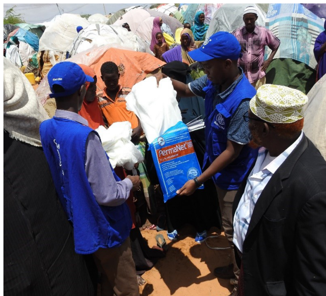
IOM's Migration Health Division (MHD) distributing long-lasting insecticidal nets (LLIN) in internally displaced people (IDP) sites in Mogadishu, Banadir Region

In September, IOM provided vaccinations to 7,785 children under 5, reached 23,018 people with health education, and saw 10,447 mothers for antenatal care (ANC) visits. In addition to IOM's frontline emergency response activities, IOM distributed approximately 159,400 long-lasting insecticidal nets to 42,350 households displaced by drought, living in the IDP camps in Kaxda, Hodhan, Dharkenley and Hamar Jajab Districts of Banadir Region. The first phase of the distribution was held from 12 to 28 in coordination with UNICEF, the Ministry of Health's National Malaria Control Programme (NMCP), and WARDI (partner of IOM). The objective of the distribution is to contribute to the reduction in morbidity and mortality rates due to malaria in Somalia by reducing vector-human contact. Preparations for the Kismayo and Galkayo distribution are underway with a second distribution in Mogadishu planned next month. IOM has also started preparations for expansion of PHC activities into Sanag, on both sides of the disputed Somaliland/Puntland border, as well as in Bardhere District, in Gedo.