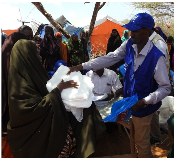
IOM's Migration Health Division (MHD) distributing long-lasting insecticidal nets (LLIN) in internally displaced people (IDP) sites in Mogadishu, Banadir Region

5,800 IDP households received emergency shelter materials and non-food items (NFIs) in Banadir and Gedo regions