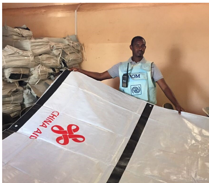
Arrival of China-Aid-branded plastic sheets in Doolow.

In September, upwards 2,600 households have been targeted for shelter upgrade support in Doolow, as current structures are make-shift, derelict, and not water or dust resistant. Over 2,600 plastic sheets have been received and mass registration and distribution will be held throughout the month of October. The preparation for the emergency shelter support to 450-500 households in Mogadishu is currently under preparation. Due to a recent request for emergency shelter in Baidoa where rains have now started and where people are exposed to the elements, upwards of 1000 tarpaulins are being prepared for transport. A new Shelter Cluster lead has been recruited by the humanitarian community and IOM will contribute heavily to inter-agency discussions and strategies by relaying recent experiences and sharing appropriate connections among government, local authorities, and internally displaced communities.