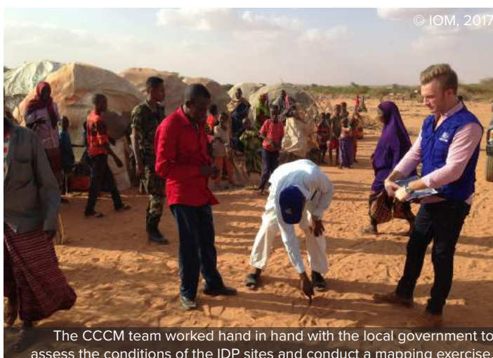
The CCCM team worked hand in hand with the local government to assess the conditions of the IDP sites and conduct a mapping exercise.