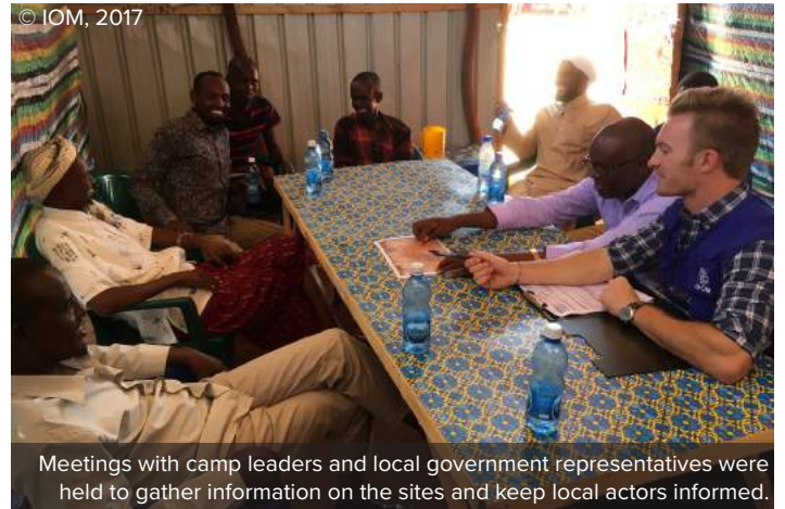
Meetings with camp leaders and local government representatives were held to gather information on the sites and keep local actors informed.