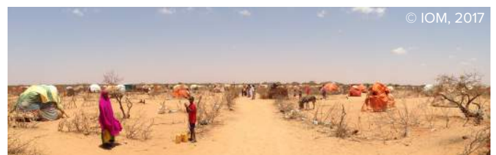
In Qansaxlay, the main concerns are service provision and shelter support.

Other clusters: address the urgent needs of increasing the water supply, construct additional latrines, provide shelter material and essential NFIs, and health care – primarily targeting the 2017 arrivals.