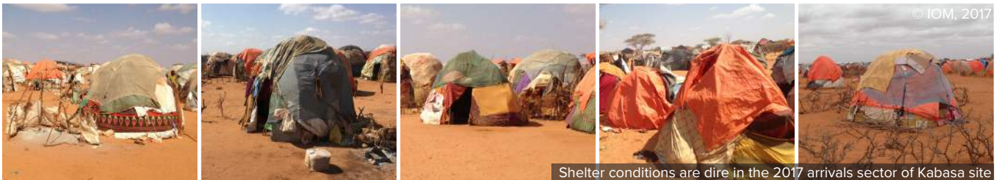
Shelter conditions are dire in the 2017 arrivals sector of Kabasa site