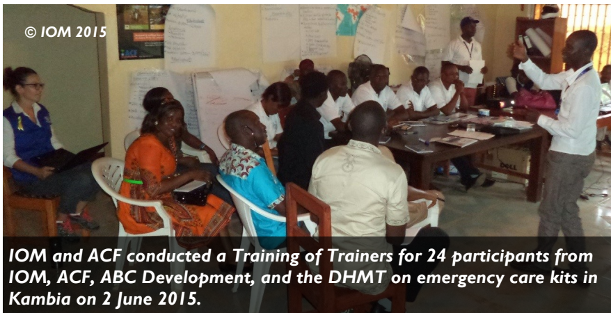
IOM and ACF conducted a Training of Trainers for 24 participants from IOM, ACF, ABC Development, and the DHMT on emergency care kits in Kambia on 2 June 2015.

On the 3-4 June, IOM field monitors ran through data collection pilot exercises using paper based forms and showed a high degree of success.