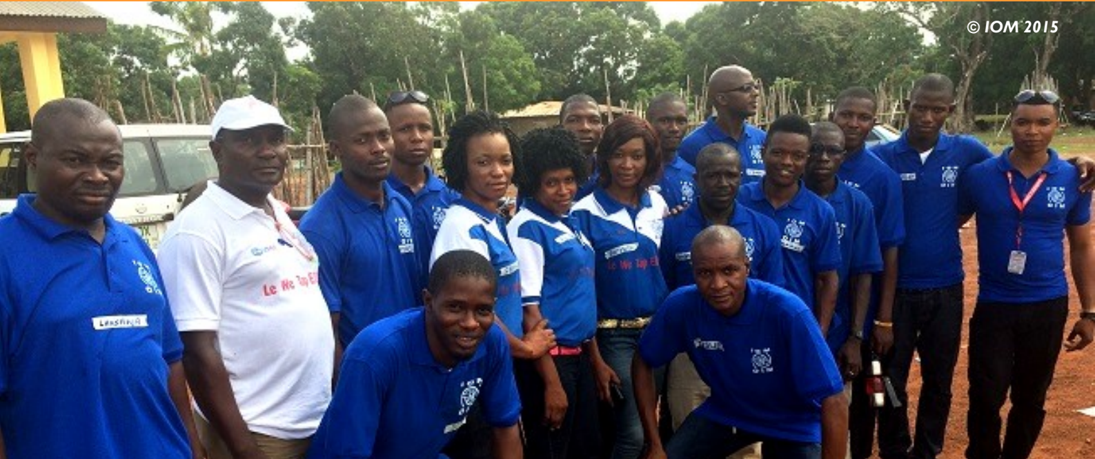
IOM's newly trained team of HHBM field monitors outside of the Kambia District Ebola Response Center (DERC) after completing training on IPC and EVD specific modules on 3 June 2015. Over the past 2 weeks the newly recruited monitors have been trained by IOM senior monitors from Lungi International Airport. The new team's deployment to the Kambia-Guinea border has had an immediate and positive impact on the health screening process and traveler safety.