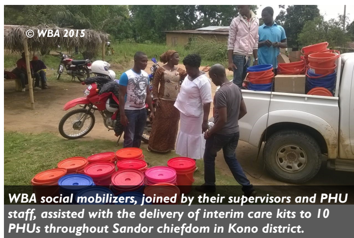
WBA social mobilizers, joined by their supervisors and PHU staff, assisted with the delivery of interim care kits to 10 PHUs throughout Sandor chiefdom in Kono district.

explored. Similarly, on 7 May a meeting between IOM, ACF and DfID was held in Kambia in order to discuss and harmonize the prepositioning of Interim Care Kits across 880 district communities.