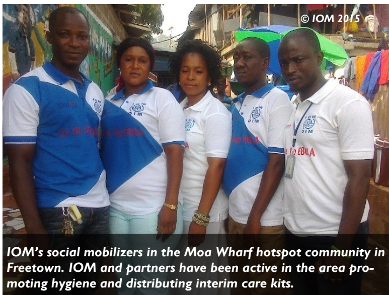
IOM's social mobilizers in the Moa Wharf hotspot community in Freetown. IOM and partners have been active in the area promoting hygiene and distributing interim care kits.

The Kono District Emergency Response Center has lauded the efforts of the social mobilization pillar in keeping communities protected as 72 days have passed without a confirmed Ebola case in Kono. However, Kono continues to see high numbers of measles and late stage malaria patients in the government hospital and PHUs, so WBA's Community Health Workers (who have been trained in measles identification and referral protocols) are playing an instrumental role in encouraging sick persons to go to a medical facility as early as possible.