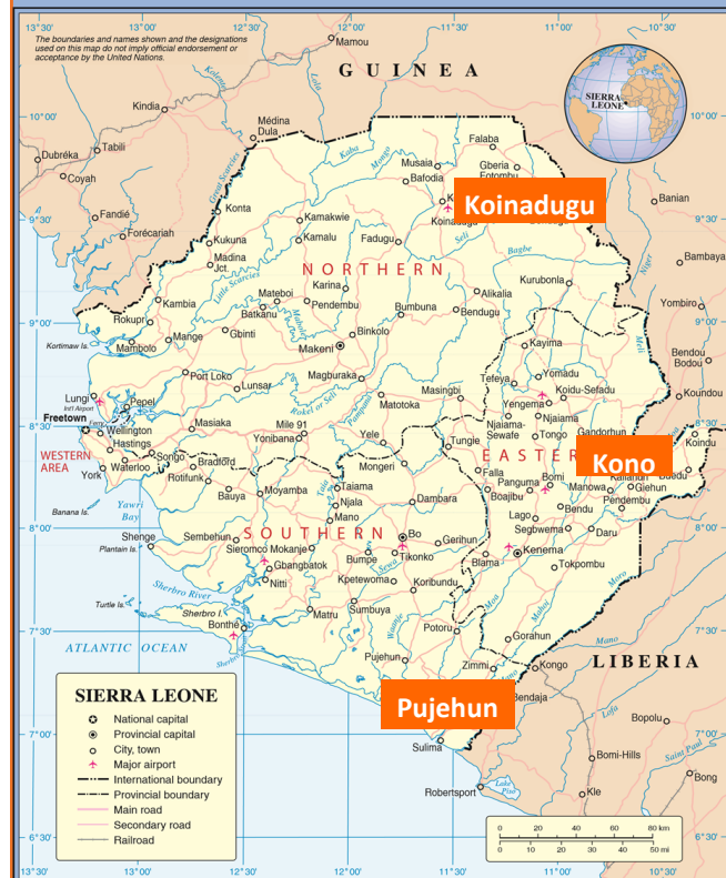
Map No. 2902 Rev. 0 UNITED NATIONS February 2004