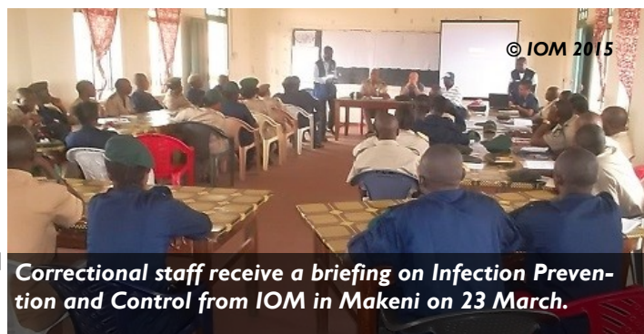
Correctional staff receive a briefing on Infection Prevention and Control from IOM in Makeni on 23 March.

Bombali borders Guinea to the north and Guineans frequently enter Sierra Leone to seek medical attention.