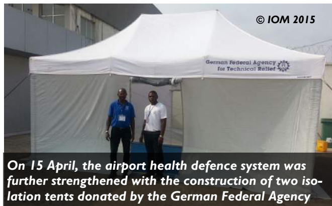
On 15 April, the airport health defence system was further strengthened with the construction of two isolation tents donated by the German Federal Agency

port has been completely reconstructed. This new structure provides much needed shelter from inclement weather for 24-hour health screening.