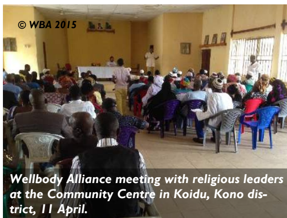
Wellbody Alliance meeting with religious leaders at the Community Centre in Koidu, Kono district, 11 April.

IOM's implementing partner in Kono, Wellbody Alliance's social mobilizers discussed EVD with 2,922 household and led 259 community meetings. On 11 April they gathered with over 100 religious leaders from throughout Kono district and their clinicians answered pre-submitted questions about EVD pathology, transmission and treatment followed by an open forum question and answer session. The gathering improved awareness of current community concerns and the information provided by clinicians will be shared with