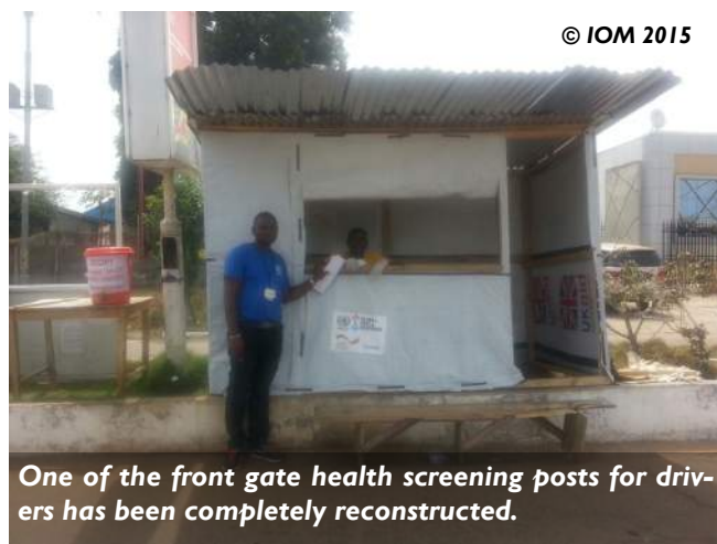
One of the front gate health screening posts for drivers has been completely reconstructed.