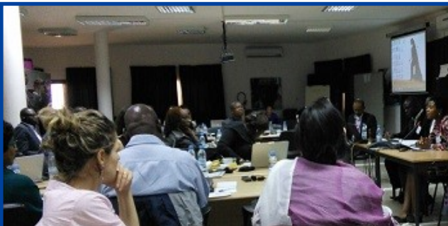
EVD survivor support meeting in Dakar

The UNMEER and Regional UN system in West and Central Africa held a Consultative Meeting on Programme Planning and Support to Ebola Survivors Workshop from the 29 -30 January 2015 at the UNICEF West & Central Africa Regional Office in Dakar, Senegal.