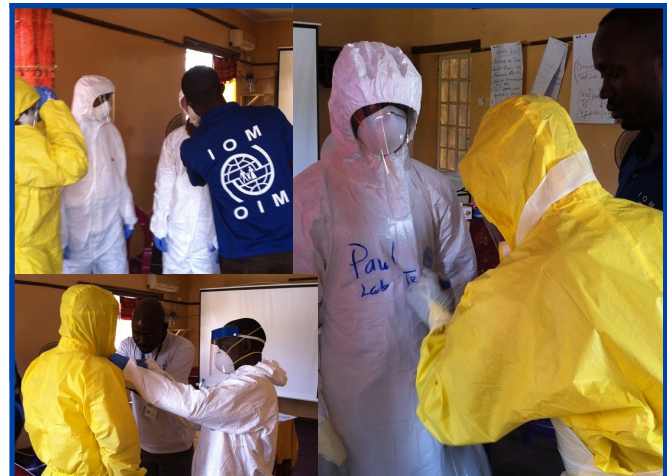
Swab collectors receive IPC training at the Bo District Ebola Response Center under IOM's new Mobile Training Project

of post deployment training as it allows for reinforcement of classroom and practical learning and real time corrections and adjustments. It also provided opportunities for trainers to develop a better understanding of the trainees' situation on the ground—availability of essential materials and collaborative agencies and partners that influence their work.