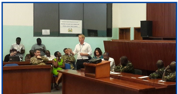
HHBM Project Manager addressing the NERC

Whilst remaining focused on the health security of the airport, the HHBM team played an important facilitation role at the Mano River Union conference last week in Freetown where the working groups considered health issues at land border crossings.