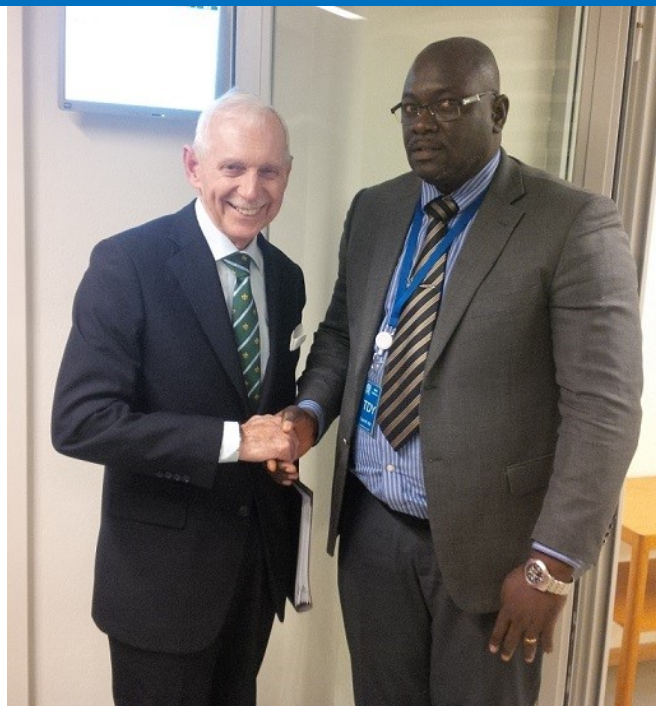
IOM DG, William Lacy Swing and IOM Sierra Leone Head of Mission, Sanusi Savage

We have recently launched the distribution of Emergency Interim Care Packages project and related messaging by community-based teams to suspected Ebola cases undergoing temporary quarantine at home due to lack of Ebola treatment facility bed space in the Western Area, Port Loko, and Bombali. Interim care kits contain ORS, water