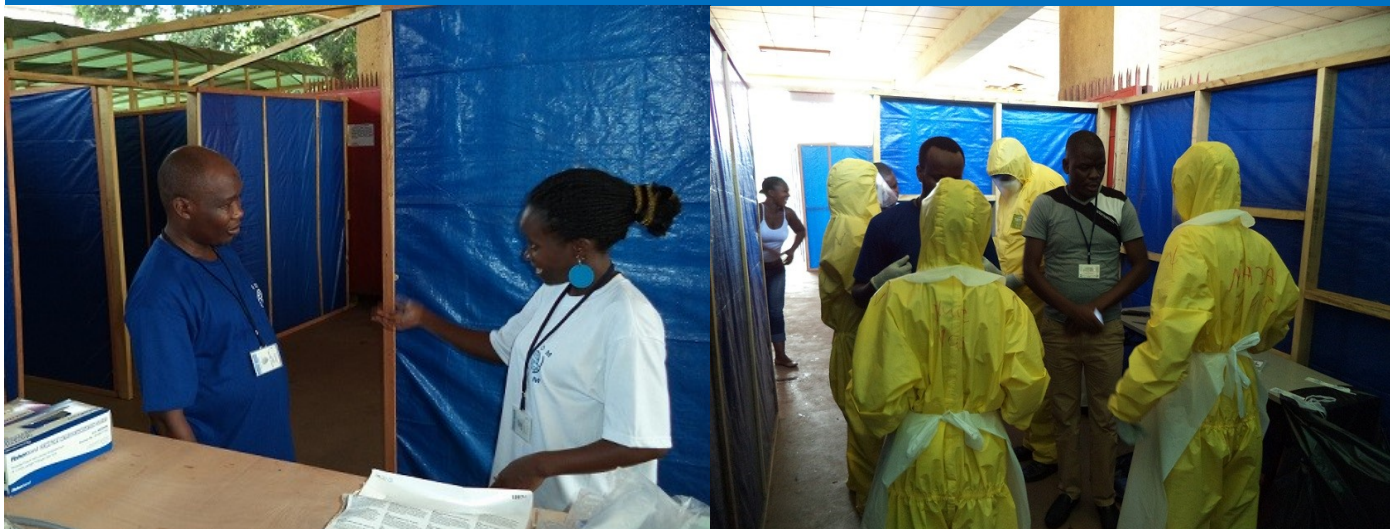
IOM Staff at the mock ETC (left) and assisting medical practitioners with PPE training at the Training Academy (right)