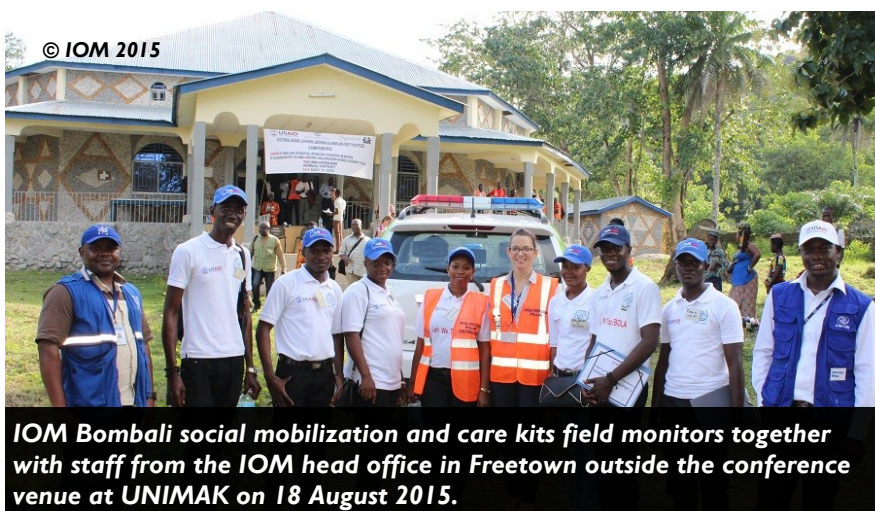
IOM Bombali social mobilization and care kits field monitors together with staff from the IOM head office in Freetown outside the conference venue at UNIMAK on 18 August 2015.