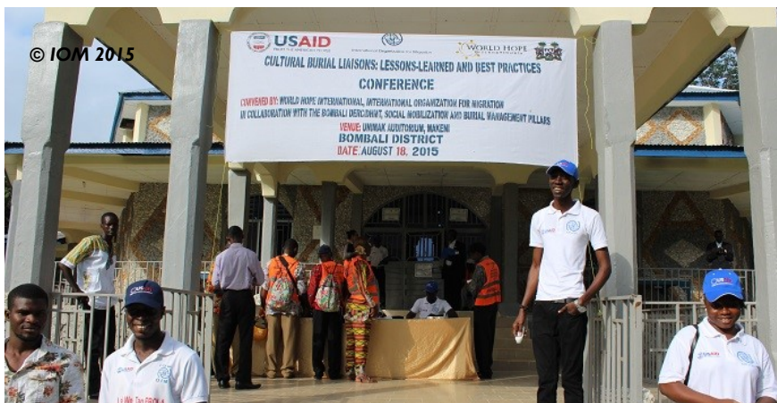
IOM staff greet conference attendees at the entrance to the UNIMAK auditorium on 18 August 2015.