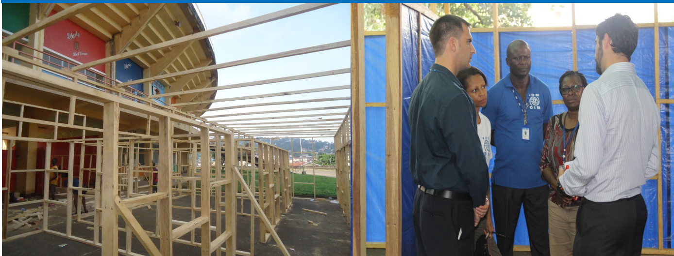
Mock ETU under construction at National Stadium in Freetown (left), after completion (right)