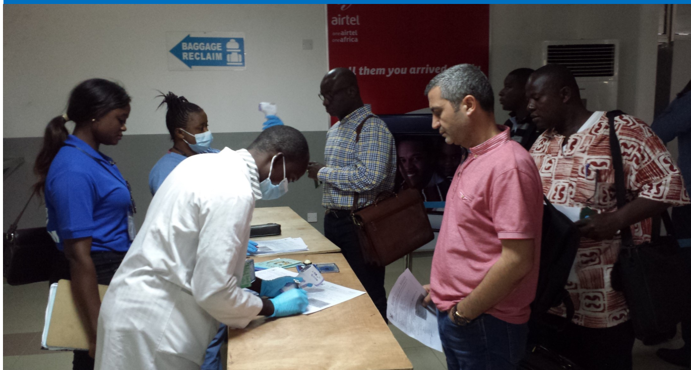
Checking entry documents after temperature scan at Lungi International Airport