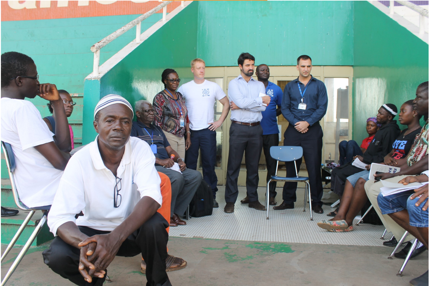
IOM Project team and donors meet with Ebola survivors at the IOM National Ebola Training Academy