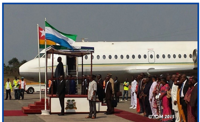
President Koroma of Sierra Leone awaiting the arrival of President Gnassingbé of Togo on February 6.

IOM Academy training for specific health screening roles, including – Clinical practitioners, Hygienists and