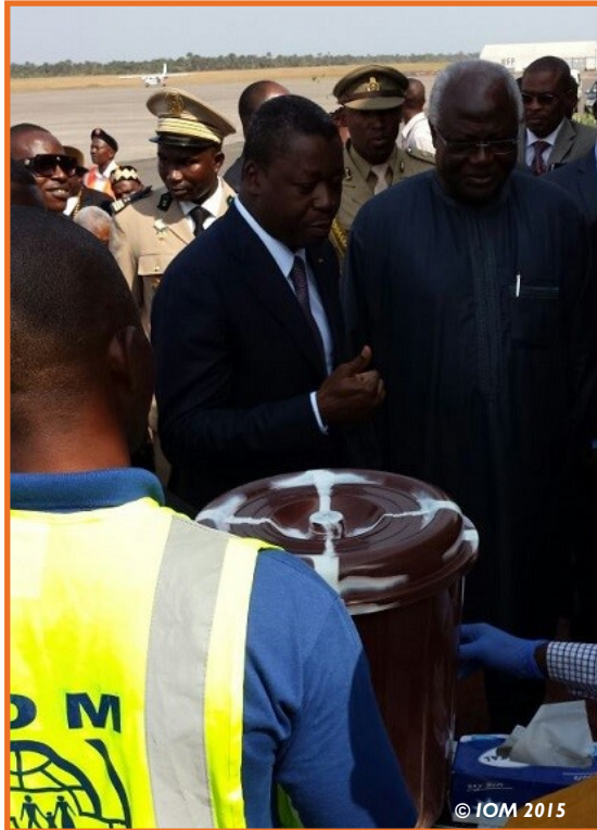
President Gnassingbé of Togo and President Koroma of Sierra Leone moving through IOM's entry health screening process.