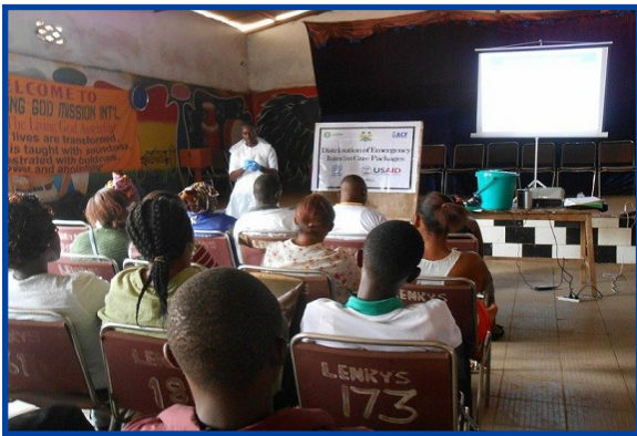
ACF's training for CHWs in Wellington, Western Area.

IOM's implementing partner, Oxfam, continues interim home care kit distribution through their community-based active case finding activities across seven wards in the Western Area. All Community Health Care supervisors and team leaders have been trained. 109 emergency interim care kits have been distributed in the Western Area by Oxfam's teams in the two pilot wards of Kontolloh and John Thorpe. Among the people identified, 17 were referred to a Community Care Centre (CCC), with one positive test result for Ebola. In Port Loko, Oxfam completed training of 263 Village Health Committee (VHC) members. Active case finding has been initiated in Koya chiefdom, prioritizing communities surrounding the Ebola Isolation Centre in Masiaka.