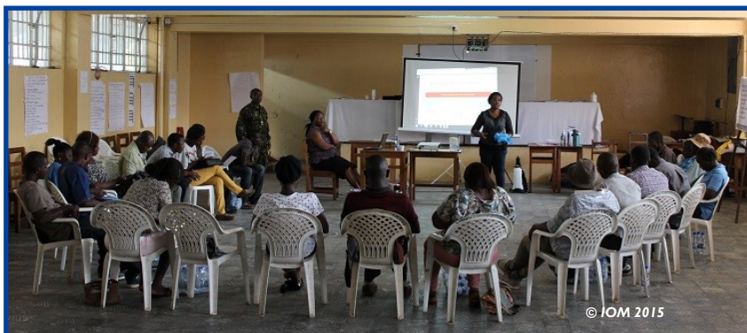
Students at the Faculty of Nursing training on an IPC module