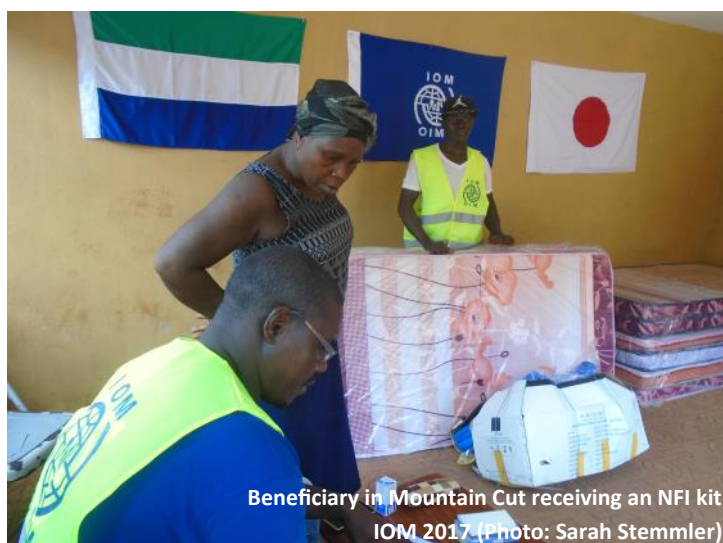
Beneficiary in Mountain Cut receiving an NFI kit IOM 2017

On 29 August, IOM distributed NFI kits to 150 flood and mudslide affected households in Mountain Cut. NFI kits distributed include tarpaulins, mattresses, blankets, bucket (30 L), jerry cans (22 L), plates, mugs, spoons, cooking pots, cooking spoons, and a kitchen knife. IOM's provision of NFIs was performed in coordination with the World Food Programme (WFP) and in result complemented by a food distribution. Previously, IOM distributed NFIs to a total of 317 affected households: 127 households in Dwazark on 26 August