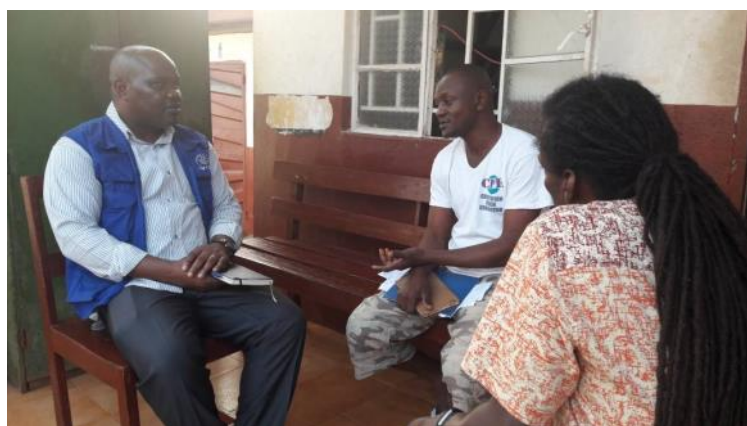
IOM Officer in Charge and CCCM expert meet with the medical staff to assess the medical clinic in Juba Barrack site IOM 2017