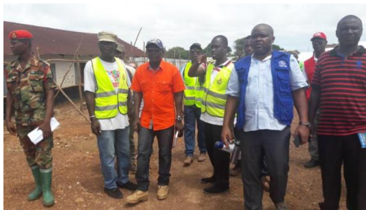
IOM Officer in Charge participates in Government Delegation assessment visit of Juba Barrack site IOM 2017