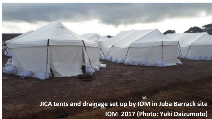
JICA tents and drainage set up by IOM in Juba Barrack site IOM 2017

WASH Pillar partners are supporting Juba Barrack with setting up water tanks, showers and latrines. IOM set up 25 handwashing stations and provided eight waste bins (300L)