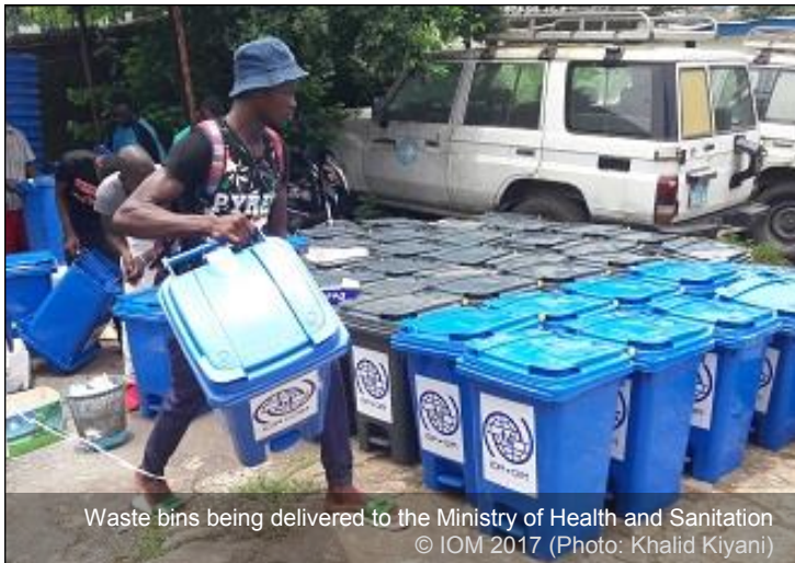
Waste bins being delivered to the Ministry of Health and Sanitation