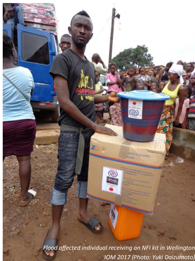
Flood affected individual receiving an NFI kit in Wellington IOM 2017

IOM is providing technical support to the Health pillar, particularly in surveillance, case management, laboratory, Infection, Prevention and Control (IPC)/WASH, logistics, social mobilization and communications. At the request of the Ministry of Health and Sanitation (MoHS), and in coordination with the Health/Burial sub-Pillar, IOM is providing IPC materials/supplies to be used for cleaning and decontamination as well as personal protection for burial teams, hospital staff treating victims, and displaced communities. IOM delivered IPC and WASH supplies to the MOHS for onward distribution to the burial teams and rescue teams, affected hospitals, peripheral health units and communities. The distributed items include: shovels, examination gloves, heavy duty gloves, chlorine (50 KG), disposable aprons, face masks, buckets with tab, gowns, scrub suits, digital thermometers, liquid soap, waste bins, and surgical gowns.