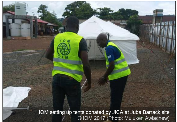
IOM setting up tents donated by JICA at Juba Barrack site