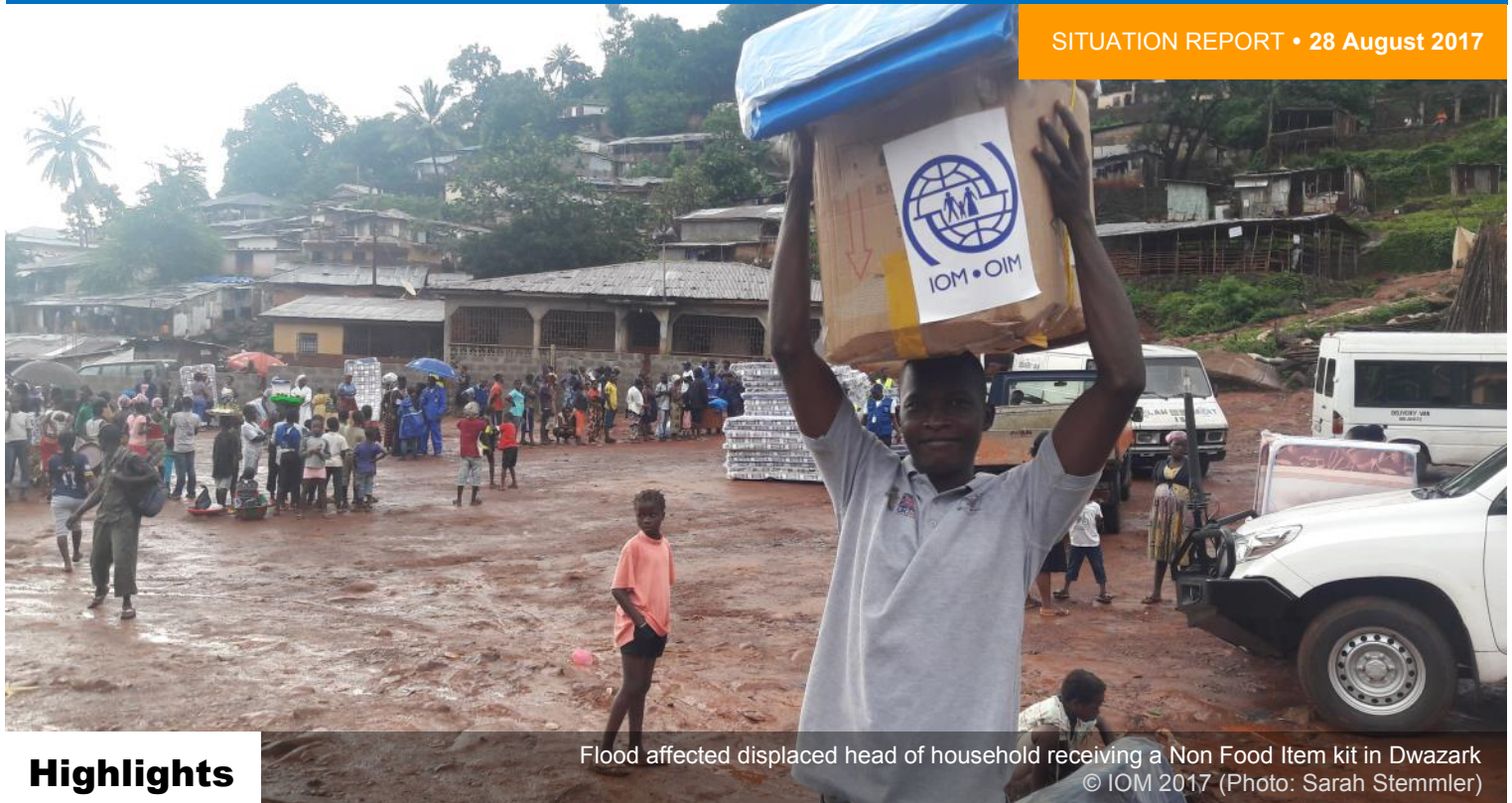
Flood affected displaced head of household receiving a Non Food Item kit in Dwazark