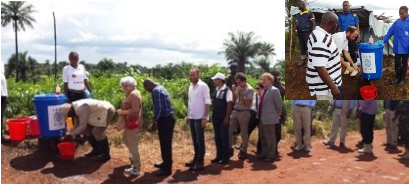
A high level visiting delegation from Guinea joined by the Kambia district coordinator and the UN field coordinator outside of Sella Kafta community.

The outbreak in Sella Kafta community in Tonko Limba Chiefdom, Kambia District drew major interventions from NGOs and UN agencies including IOM which set up and manned health screening posts at all 4 entry and exit routes surrounding Sella Kafta.