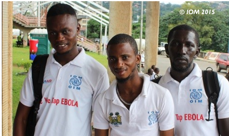
IOM Social Mobilizers at Siaka Stevens Stadium on 25 September 2015.

The question and answer session was very interactive and at the end of the training, all of the social mobilizers were able to individually perform correct hand washing techniques and answer all evaluation questions that were asked by IOM IPC trainer Gildo Okure.