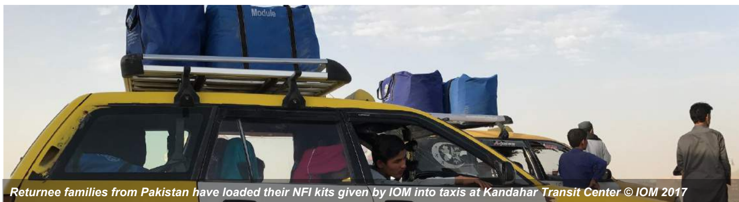
Returnee families from Pakistan have loaded their NFI kits given by IOM into taxis at Kandahar Transit Center