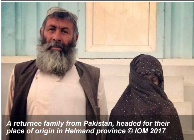
A returnee family from Pakistan, headed for their place of origin in Helmand province