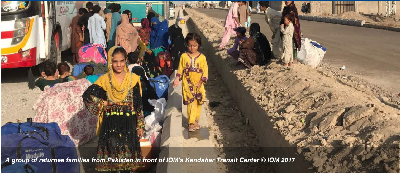
A group of returnee families from Pakistan in front of IOM's Kandahar Transit Center