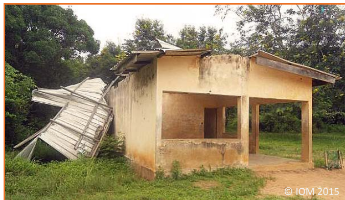
Current condition of the official border post at Dohouba, Côte d'Ivoire on the Liberian border

border, a lack of personal protective equipment, and the need for more practical training on Ebola preparedness.