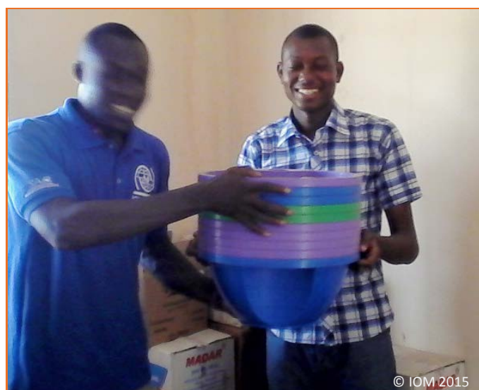
Hygiene Kits distributed at the border post in Fongolimbi, Senegal to promote EVD awareness and prevention

As part of its EVD preparedness and monitoring activities at the border, IOM Senegal distributed to nursing heads of posts based in three strategic entry points of Ségou, Fongolimbi and Oubadji. 44 hygiene