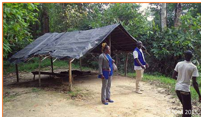
An unofficial border post at Kpantoupleu, Côte d'Ivoire on the border with Liberia

Key areas of IOM's intervention at the border posts were determined to include equipping law enforcement agents with protective equipment and hygiene materials, raising EVD awareness, and supplying adequate hand washing stations and consumable goods.