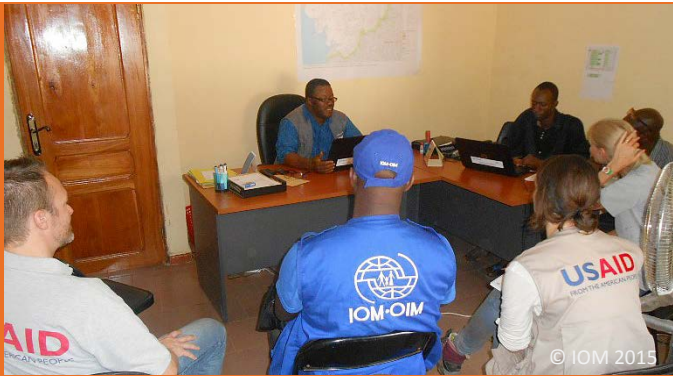
USAID and IOM meet with local health officials at the IOM-renovated Emergency Operations Centre in Forecariah, Guinea

IOM Guinea continues to carry out Flow Monitoring activities at the three borders points of Kourémalé, Nafadji, and Niani. These activities include EVD sensitization in the local language, as well as collection and processing of migrant travel data. Eight Flow Monitoring Point agents received training to familiarize them with the updated version of the data collection sheet, which now includes four health-specific questions.