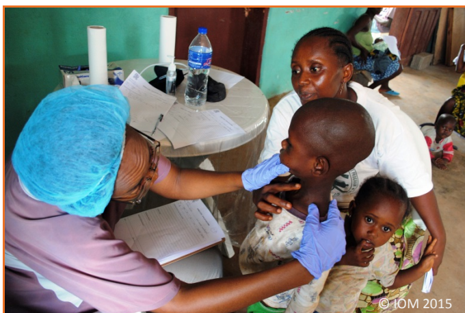
Nurse examines a young patient at a Mobile Clinic in Bomi county, Liberia

IOM is supporting County Health Teams in providing basic health care services to communities in Bomi, Grand Bassa, and Grand Cape Mount counties through mobile clinics. The clinics, in addition to providing primary healthcare, are a means of administering vaccines and de-worming children in targeted communities. Since 13 April, 126 patients have received treatment at two locations in Grand Cape Mount, IOM Bomi has treated 595 persons and dewormed 165 , while IOM Grand Bassa has provided care to 252 patients and immunized 203 persons