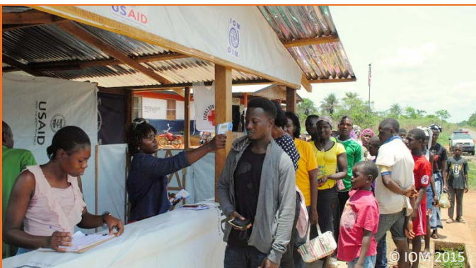
Border officers and health staff screen travellers at the Bo Waterside border crossing in Liberia

IOM Liberia is providing support and health screening services at Bo Waterside, a primary border crossing point between Liberia and Sierra Leone. Between 13 and 26 April, IOM screened more than 17,470 travellers, all of whom were cleared. In addition, IOM is ensuring health screening services at two key checkpoints, Tienni and Sinje, in Grand Cape Mount.