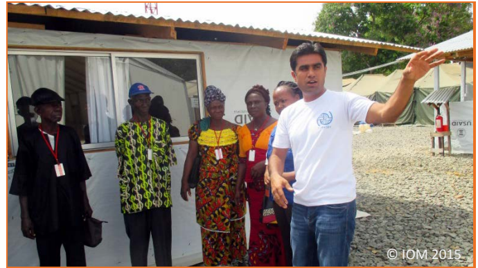
IOM's Water, Sanitation and Hygiene officer explains the technical aspects of ETU decommissioning to community leaders at the Tubmanburg ETU in Liberia