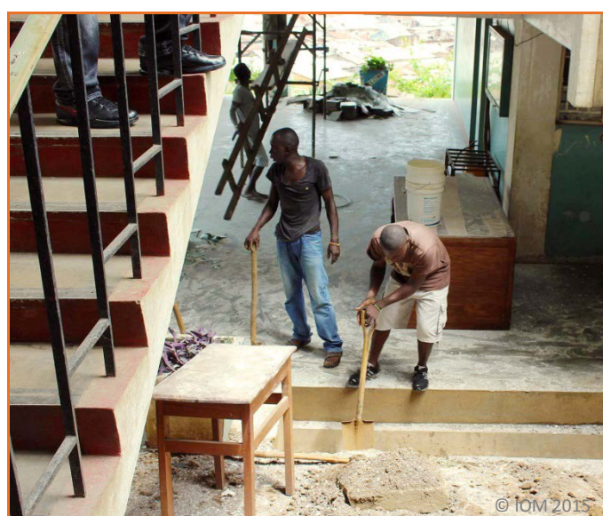
Refurbishment of the Faculty of Nursing, College of Medicine and Allied Health Services commences in Freetown, Sierra Leone

On 1 May the refurbishment of the Faculty of Nursing, College of Medicine and Allied Health Services began in Freetown. IOM is renovating the faculty over the next 2 months to coincide with the official reopening.