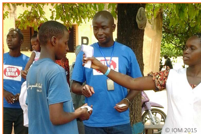
Flow Monitoring agents conduct health screening and distribute EVD prevention cards to visitors of the Sélingué Musical Festival in Mali

urban festival. The FMP agents also distributed approximately 6,000 prevention cards at the city entrance, as well as conducting temperature screening and hand washing sensitization to raise awareness about EVD.