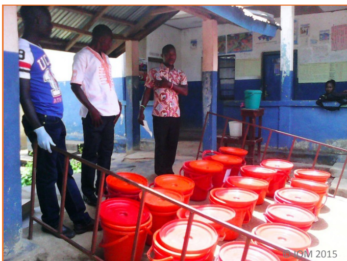
Emergency care kits delivered to a Community Health Centre in Kono district, Sierra Leone

Through their community-based activities, IOM's implementation partner, World Hope International (WHI), conducted social mobilization activities focusing on school reopening, with a total of 2,130 pupils reached with Ebola awareness messaging. In collaboration with the Burial Pillar, Bombali district, cultural liaison teams completed their training session. A total of 129 Cultural Liaison Officers (83 males, 46 females) were trained. With continuous social mobilization activities in the rural communities led by community-based social mobilizers, the Pillar rapid response team and other partners, the district has not detected any case of EVD in the last 36 days.