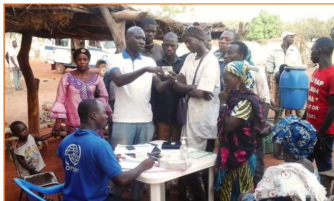
Flow Monitoring agents conduct health screening and distribute EVD prevention cards in Banankoro, Mali

IOM Mali carried out a feasibility assessment of social mobilization activities in the Sikasso Region. The assessment concluded that mining sites in Kayes region were a potential risk zone, therefore activities, such as popular dramas (theatre production), will be developed in order to reach out to the communities.