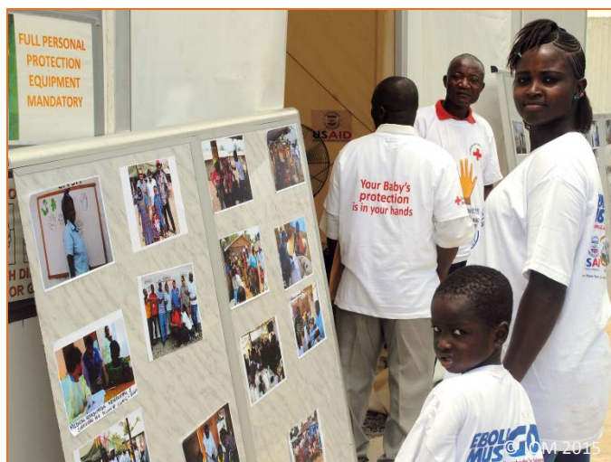
Ebola Survivors revisit the Tubmanburg ETU for a Photo Exhibition at the Closing Ceremony in Liberia

On 9 May 2014, Liberia was declared Ebola free. In order to build resilience and respond to future health-related challenges, IOM is supporting the County Health Teams (CHTs) to build local capacity for safe isolation, triage and referrals. IOM is still performing clinical and operational management of one Ebola Treatment Unit (ETU) in Sinje, Grand Cape Mount (GCM) County.