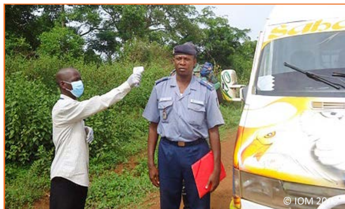
Border Control officials undergo simulated health screening training in Touba, Côte d'Ivoire

Furthermore, with support from the IOM Development Fund, IOM Côte d'Ivoire is transporting hand-washing stations, mattresses, personal-protective equipment and infection-control materials to points of entry along the western border with Guinea and Côte d'Ivoire. Six