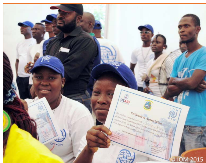
ETU staff proudly display their Certificates of Appreciation during the Tubmanburg ETU Closing Ceremony in Liberia

The Tubmanburg ETU in Bomi and Buchanan ETU in Grand Bassa stopped admitting patients on 15 April, and finalized decommissioning of the ETUs in line with World Health Organization (WHO) protocols. An official closing ceremony was held for both ETUs on 8 May.