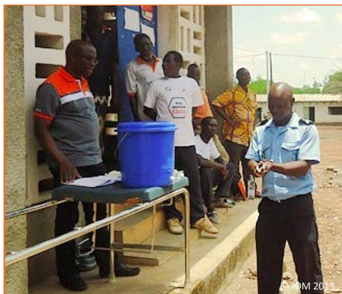
Policeman receives practical hand-sanitizing training at the border post in Odienné, Côte d'Ivoire

medical authorities along the border will receive motorcycles to enhance their ability to provide ongoing training and monitoring of Ebola-preparedness activities.