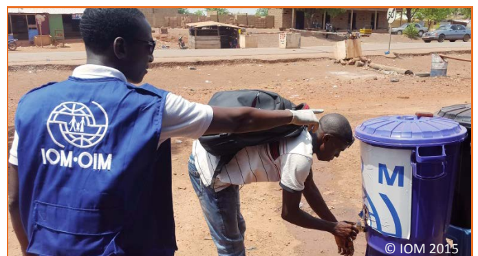
FMP agent raises awareness about the importance of hand sanitization in Kourémalé, Guinea

To promote safe migration and better health management, IOM Guinea continues to carry out activities at three border Flow Monitoring Points (FMPs) in Kourémalé, Nafadji and Niany. Since the start of the project, a total of 19,768 migrants have been recorded and monitored, passing through the three FMPs.