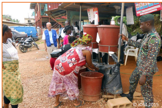
Hand washing station in Noé, Cote d'Ivoire, visited during a cross-border assessment in Elubo, Ghana

The assessment provided practical understanding of the state of preparedness at the locations visited. Furthermore, the assessment enabled the EVD project to identify gaps in effective Health and Humanitarian Border Management (HHBM) programme implementation with respect to managing suspected cases of EVD or other infectious diseases from the Point of Entry (PEO) to the treatment centre, and to make appropriate recommendations.