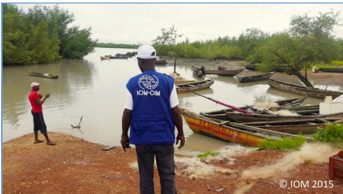
IOM conducts a participatory mapping assessment of a Fishermen's landing in Dubréka, Guinea

IOM's approach includes the deployment of Flow Monitoring Point agents to map mobility patterns and raise travellers' EVD awareness, as well as the transition to a sustainable system, capable of responding to other epidemic-prone diseases affecting the areas.