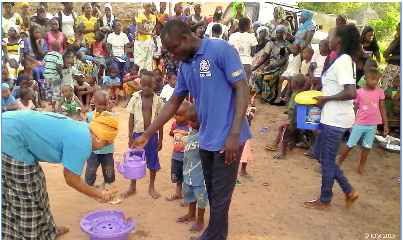
IOM's Social Mobilization Team demonstrates the importance of hand washing to prevent the spread of EVD in Ndindéferlo Kédougou, Senegal

Furthermore, IOM mobilised the border communities of Ndindéferlo (Kédougou) at the weekly market in Cambadiou (Guinea-Bissau), near Salikégné (Kolda). Over 400 people were present to receive essential EVD messaging, as well as IPC measures.