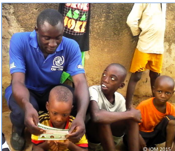
IOM social mobilizer teaches children about EVD in Ndindeferlo, Senegal

Since the Ebola outbreak in West Africa was first reported in March 2014, to date, there have been 27,952 confirmed probable and suspected cases of Ebola Virus Disease (EVD) with 11,284 fatalities (41%), according to the current WHO report. IOM is continuing its Ebola response in West Africa, which aims to strengthen containment and control capacities to prevent the spread of EVD, reduce disease burden, while contributing “getting to and maintaining zero cases, and building back better”.