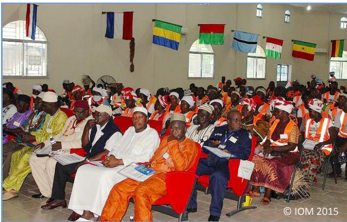
Delegates gather for the Cultural Burial Liaison: Lessons Learned and Best Practices Conference in Bombali, Sierra Leone

programme financially self-sustaining by adding a livelihoods component to the training for CBLs.