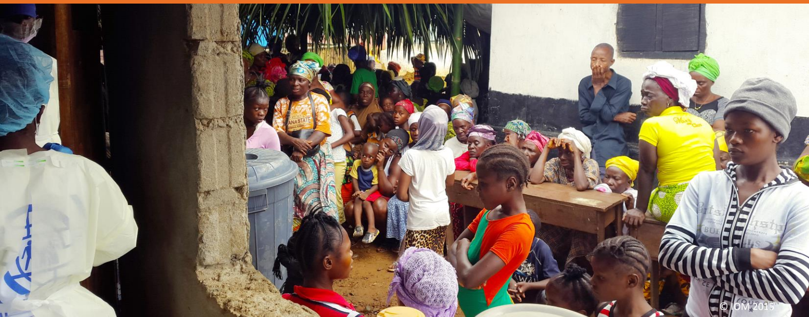
To support weakened health systems, IOM provides primary healthcare at a mobile clinic in Tubmanburg, Liberia