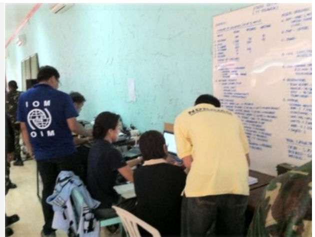
NDRRMC meeting with government and humanitarian partners