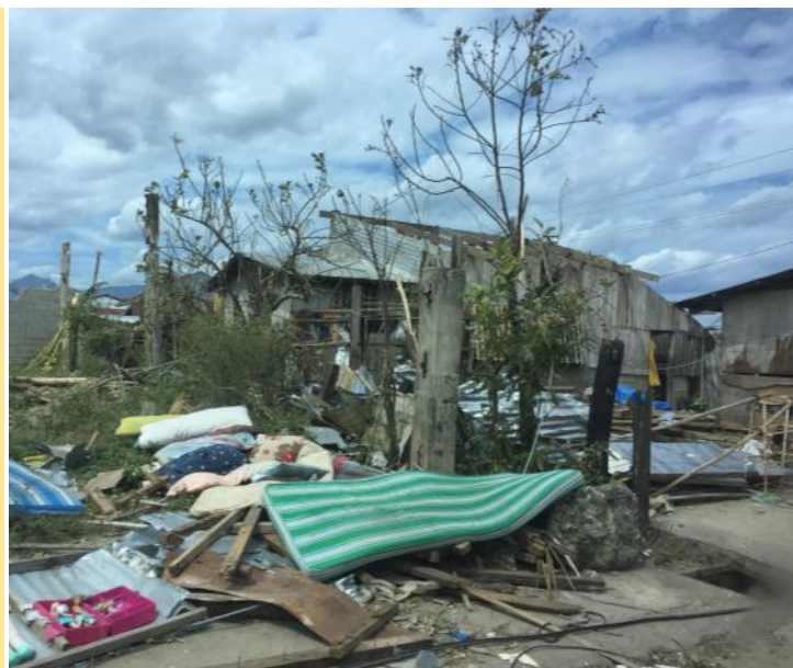
Damaged houses in Casiguran, Aurora Province