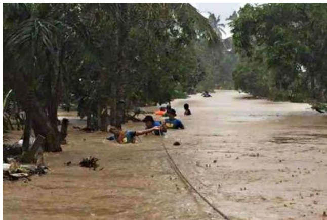
Typhoon Koppu has brought flooding to the northern Philippines.