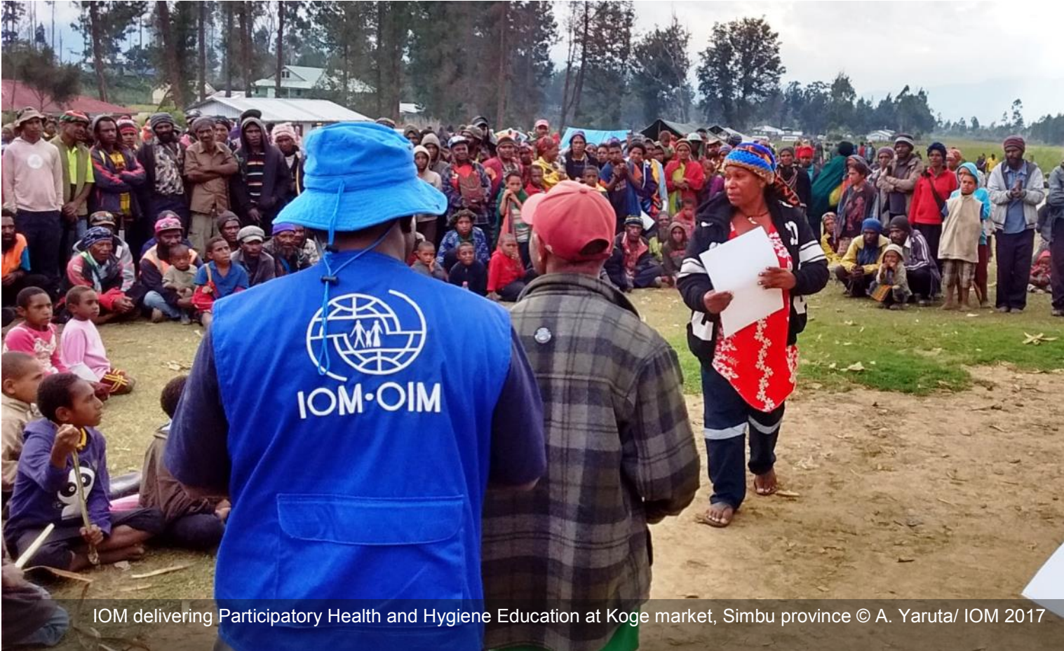
IOM delivering Participatory Health and Hygiene Education at Koge market, Simbu province © A. Yaruta/ IOM 2017

The boundaries and names shown and the designations used on this map do not imply official endorsement or acceptance by the United Nations © IOM/2017