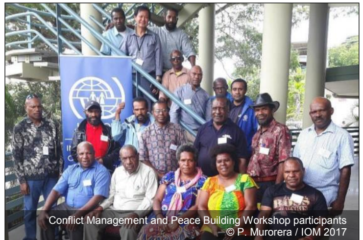
Conflict Management and Peace Building Workshop participants

IOM organized a 'Training for Transformation' workshop on conflict management and peace building in Port Moresby. Funded by the IOM Development Fund, the training targeted state actors at the national, provincial, district and local government levels, including legal practitioners, police, disaster coordinators and district administrators involved in conflict mediation and peace building. Representatives from churches and communities affected by tribal conflict in Enga and Morobe provinces also took part.