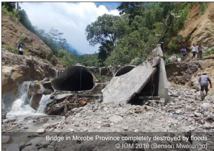
Bridge in Morobe Province completely destroyed by floods

IOM has conducted initial community assessments in North Wagi District, Jiwaka Province, targeting communities that suffered greatest damages from recent flooding and landslides. The assessments revealed that 326 people have been affected, with a total of 1,014 gardens lost. The Jiwaka Provincial Disaster Coordinator estimates that a total of 2,051 people have been affected and 12 houses have been destroyed by the floods and landslides within the province alone. Morobe Province has also experienced serious damages from flooding and mudslides. IOM in collaboration with Morobe PDC and LLG Council administrations carried out assessments in Markham and Bulolo districts on 23-24 February respectively. The assessments revealed that some 5,879 people have been affected and 963 houses have either been damaged or destroyed by the flooding and mudslides. In response to this crisis, IOM together with local authorities, is preparing for a humanitarian relief operation.