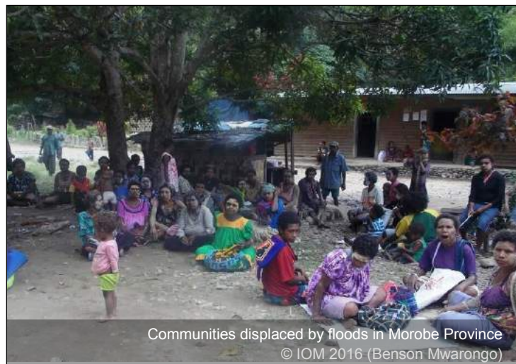
Communities displaced by floods in Morobe Province

IOM is committed to ensuring a well-coordinated and efficient response to the on-going effects of the El Niño system, and as such remains engaged in WASH, Health, Nutrition and Inter-Cluster meetings as well as the Disaster Management Team meetings.