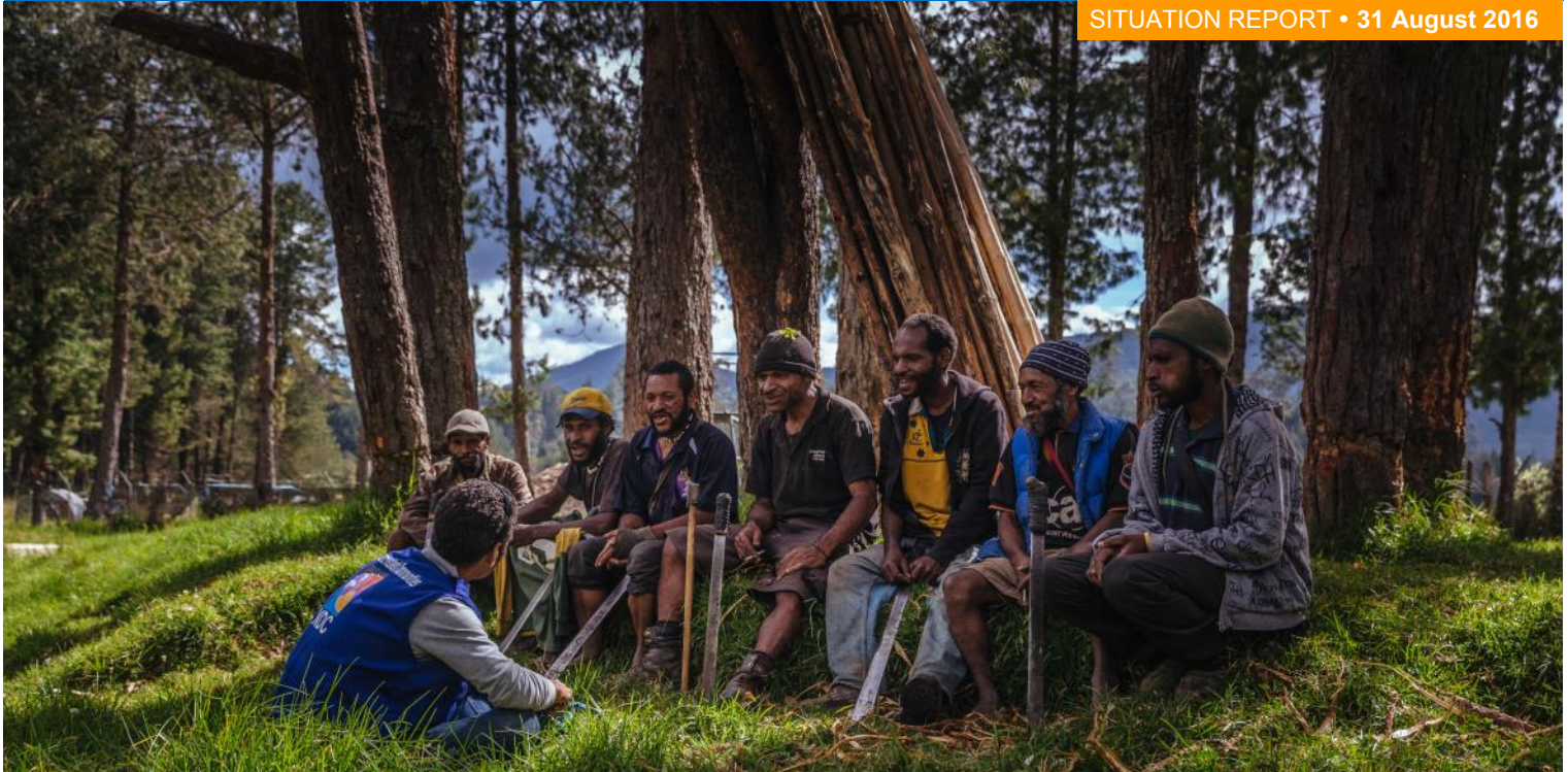
IOM Coordinator holding a conflict mediation session in the Highlands