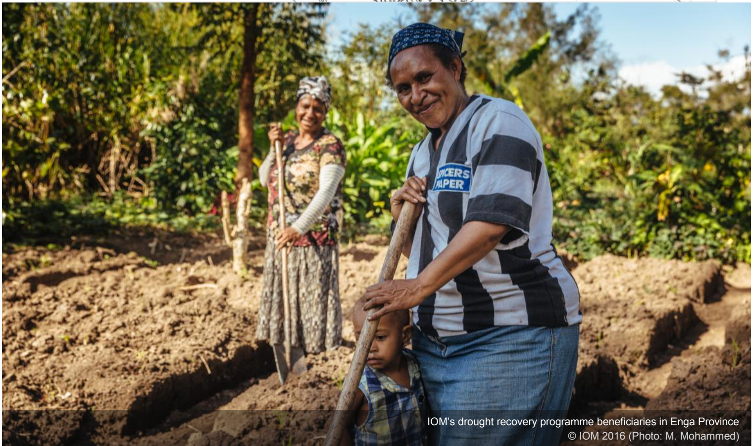
IOM's drought recovery programme beneficiaries in Enga Province