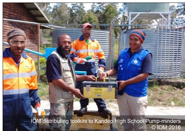
IOM distributing toolkits to Kandep High School Pump-minders

Over the past three months, IOM has conducted Participatory Health and Hygiene Education (PHHE) for 15,777 beneficiaries in the Highlands Provinces of Jiwaka, Enga and Simbu. The aim of the trainings and outreach was to promote behavioural change to the communities most affected by drought. Pamphlets have been distributed to schools and accompanied by practical demonstrations.