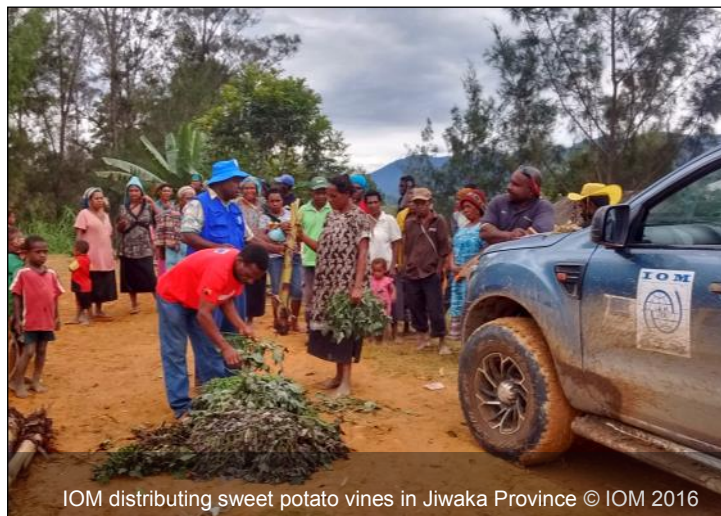
IOM distributing sweet potato vines in Jiwaka Province

During June-August 2016, IOM continued working with farmers in the Highlands Region to assist with food security and agricultural recovery as the drought eased. This included identifying and providing suitable seeds and cuttings adapted for both high altitude and the changed soil conditions (following the effects of the drought).