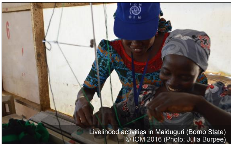
Livelihood activities in Maiduguri (Borno State)

Moreover, IOM has completed the construction of four MHPSS resource centers in four IDP camps in Maiduguri. The resource centers are utilized for group activities, counselling and livelihood activities. It is also a point of information for the community to access information about services and to seek referral.