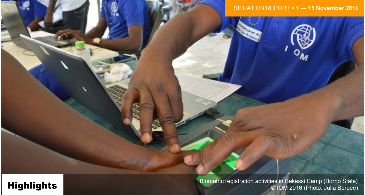
Biometric registration activities in Bakassi Camp (Borno State)